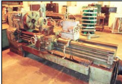
24" x 90" Leblond "Regal" Mdl. 24 Engine Lathe with 5" Spindle Bore