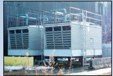
View of BAC Cooling Towers