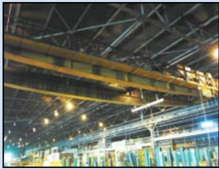
P & H 15-Ton Overhead Bridge Crane