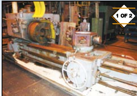
#4A Warner & Swasey Saddle-Type Turret Lathes