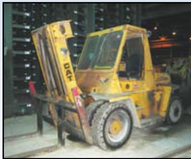
16,000# Caterpillar Mdl. V160B Forklift