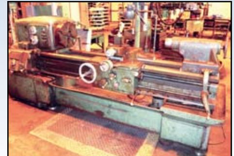
20" x 54" Monarch Mdl. 62 Engine Lathe