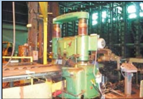
Ohler-Remscheid Tube Cut-Off Saw with Feed System