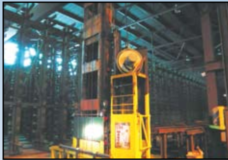
View of Abell-Howe "Stak-Master" Stacking System