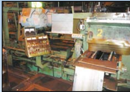
1" Beyer Dual Spindle Automatic Gun Drill