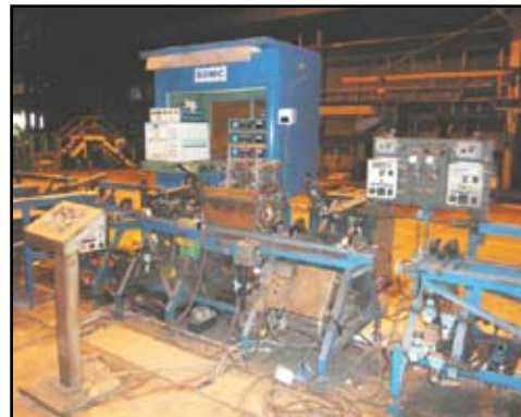
Tac Technical Instrument Corp. Ultrasonic Tube & Bar Test System