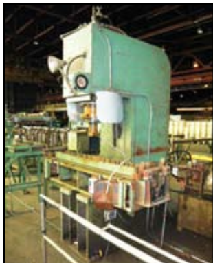
100-Ton Elmes C-Frame Hydraulic Straightening Press