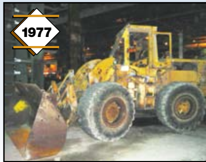
Caterpillar Mdl. 966C Articulating Front End Loader