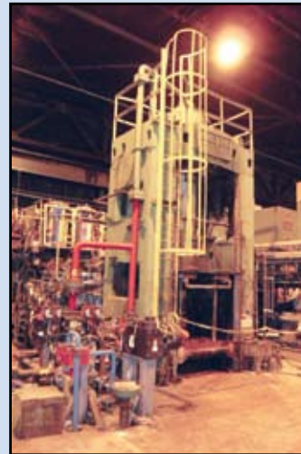
600-Ton Lake Erie Piercing Press with Induction Heaters