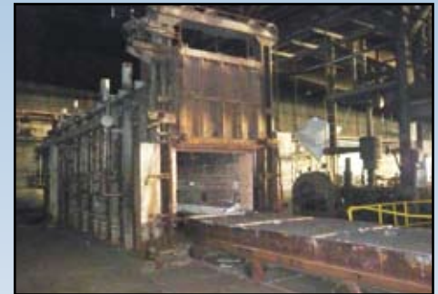
Olson Car Bottom Furnace