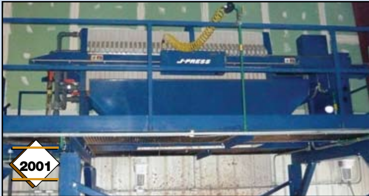
2001 JWI Filter Press