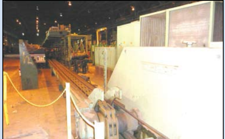
100,000 Aetna Standard Draw Bench