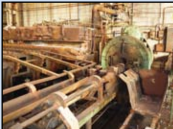
Fenn #7F Swager

Featuring: Draw Benches – Up To 100,000# • Fenn #7F Swager • 6" Tube Straightener • 6" Stretch Straightener • Over (10) Billet Saws • 600-Ton Piercing Press • 2001 Water Treatment System • Toolroom • Overhead Bridge Cranes, Up to 20-Ton • Rolling Stock • Stainless Steel Tanks • Plus Much More!