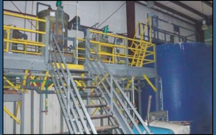
View of Water Treatment System (New 2001 – Over $400,000 New!)