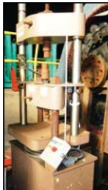
Satec Mdl. M11-120HVL Tensile Tester