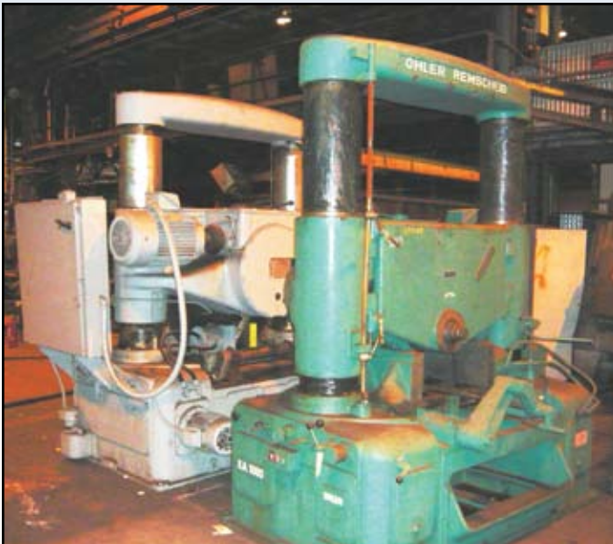
View of Rebuilt Ohler-Remscheid Billet Saws