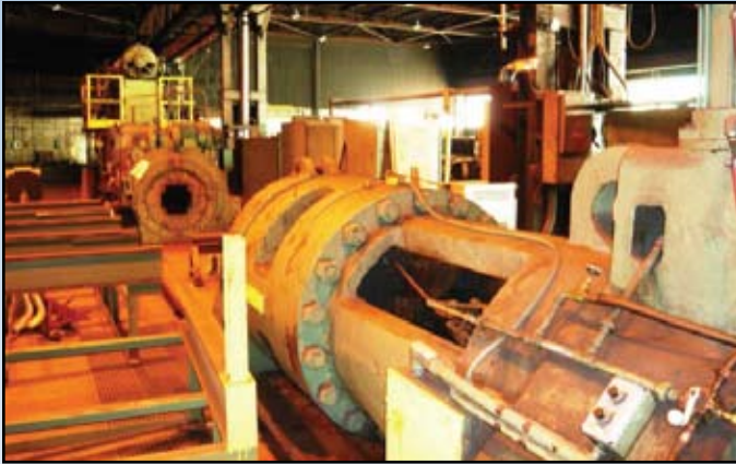
6" Sutton 375-Ton Stretch Straightener