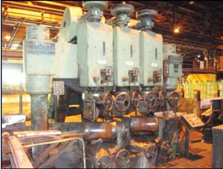
Sutton Mdl. 20SD "Syncro Drive" Tube Straightener

Featuring: Draw Benches – Up To 100,000# • Fenn #7F Swager • 6" Tube Straightener • 6" Stretch Straightener • Over (10) Billet Saws • 600-Ton Piercing Press • 2001 Water Treatment System • Toolroom • Overhead Bridge Cranes, Up to 20-Ton • Rolling Stock • Stainless Steel Tanks • Plus Much More!