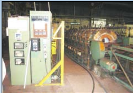
Selas Gas Fired Furnace