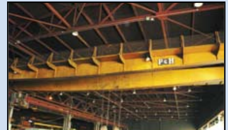
(1 of 8) Assorted P & H Bridge Cranes, Up to 20-Ton Capacity x 100' Span

Holiday Inn Express, Latham, NY ..... 800-345-8082 Holiday Inn Express, Albany, NY ..... 877-531-5084 Crown Plaza, Albany, NY ..... 877-898-1721 Best Western, Albany, NY ..... 877-574-2464