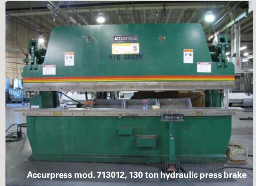
Accurpress mod. 713012, 130 ton hydraulic press brake