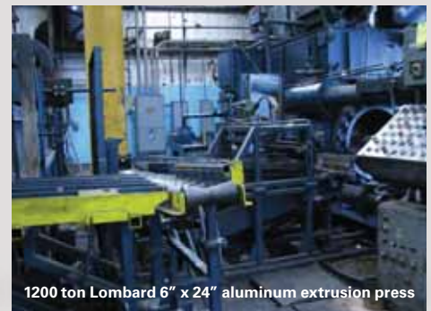
1200 ton Lombard 6" x 24" aluminum extrusion press