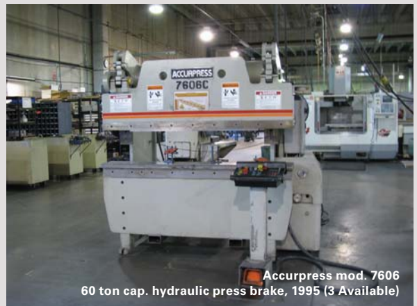
Accurpress mod. 7606 60 ton cap. hydraulic press brake, 1995 (3 Available)