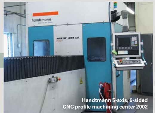
Handtmann 5-axis, 6-sided CNC profile machining center 2002