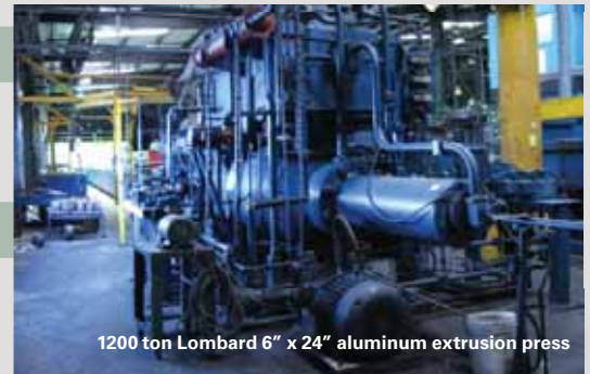
1200 ton Lombard 6" x 24" aluminum extrusion press