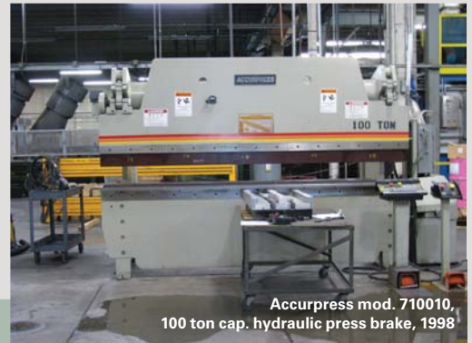
Accurpress mod. 710010, 100 ton cap. hydraulic press brake, 1998