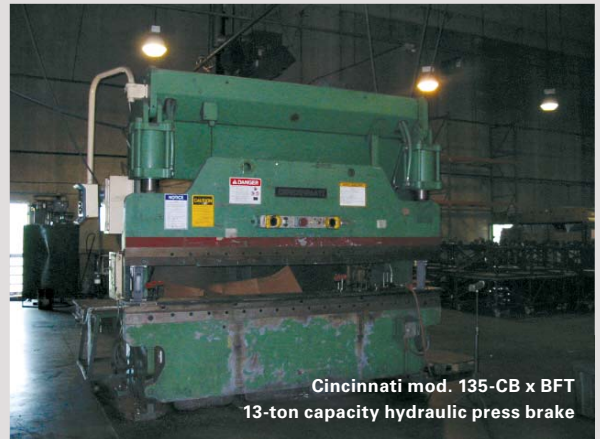
Cincinnati mod. 135-CB x BFT 13-ton capacity hydraulic press brake