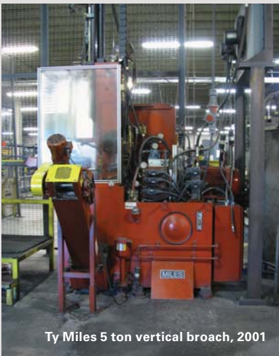
Ty Miles 5 ton vertical broach, 2001