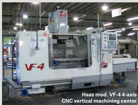
Haas mod. VF-4 4-axis CNC vertical machining center