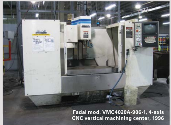
Fadal mod. VMC4020A-906-1, 4-axis CNC vertical machining center, 1996