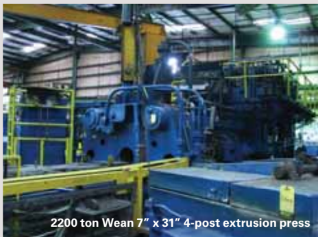
2200 ton Wean 7" x 31" 4-post extrusion press