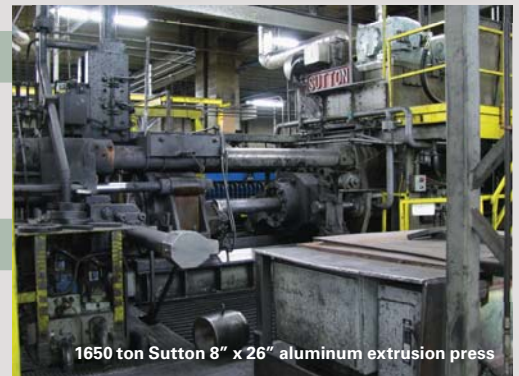
1650 ton Sutton 8" x 26" aluminum extrusion press