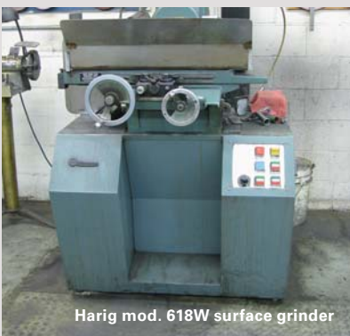
Harig mod. 618W surface grinder