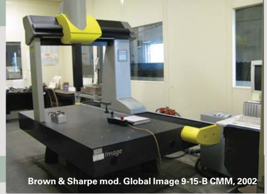
Brown & Sharpe mod. Global Image 9-15-B CMM, 2002