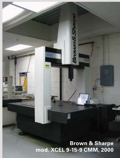
Brown & Sharpe mod. XCEL 9-15-9 CMM, 2000