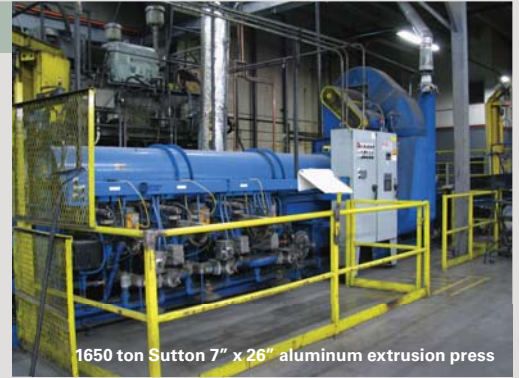
1650 ton Sutton 7" x 26" aluminum extrusion press