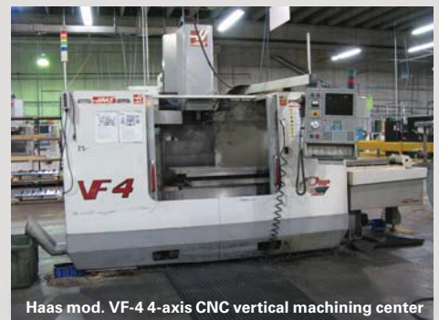
Haas mod. VF-4 4-axis CNC vertical machining center