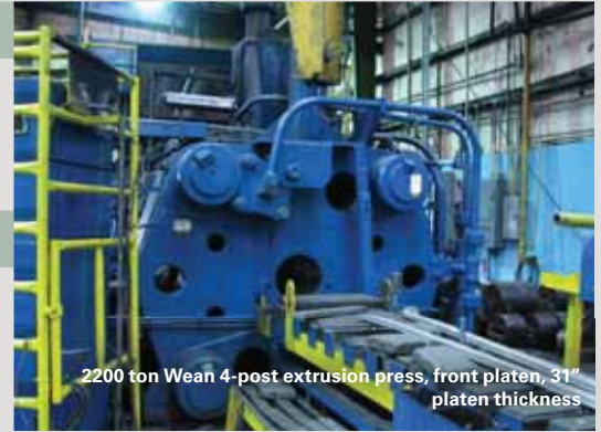
2200 ton Wean 4-post extrusion press, front platen, 31" platen thickness