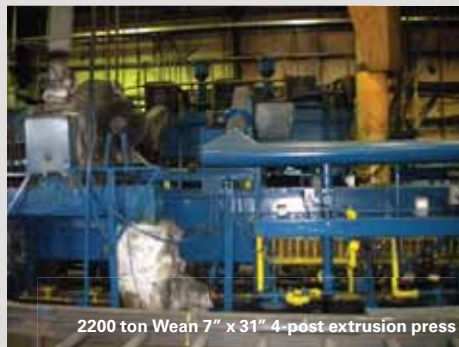
2200 ton Wean 7" x 31" 4-post extrusion press