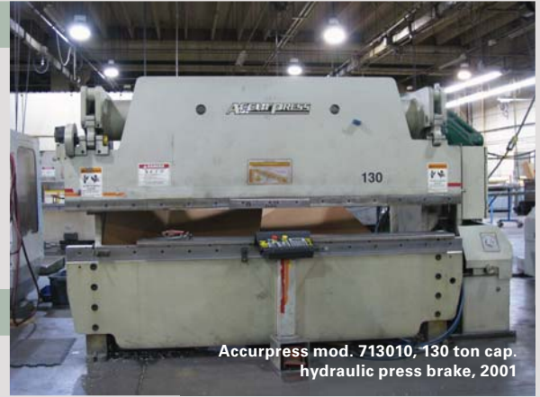
Accurpress mod. 713010, 130 ton cap. hydraulic press brake, 2001