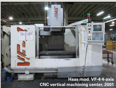
Haas mod. VF-4 4-axis CNC vertical machining center, 2001