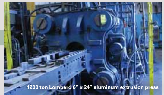
1200 ton Lombard 6" x 24" aluminum extrusion press