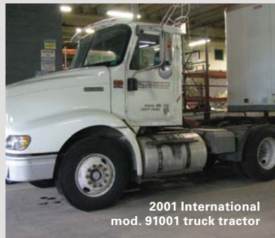
2001 International mod. 91001 truck tractor