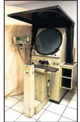
SHADOWMASTER 24" optical comparator