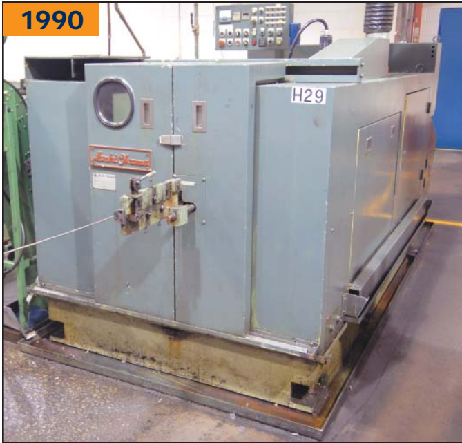
ASAHI OKUMA RH 60 2 die 3 blow cold header