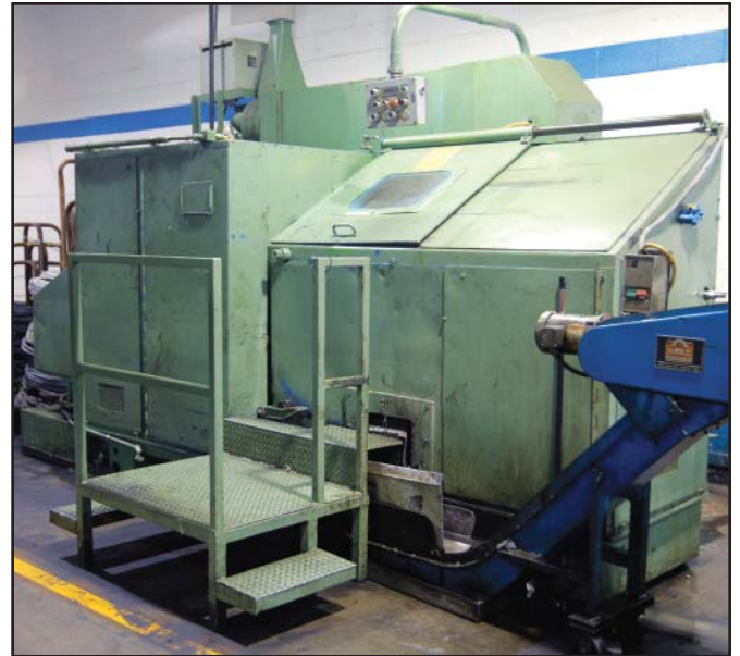
NATIONAL #68 DSSD high speed, medium stroke, cold header