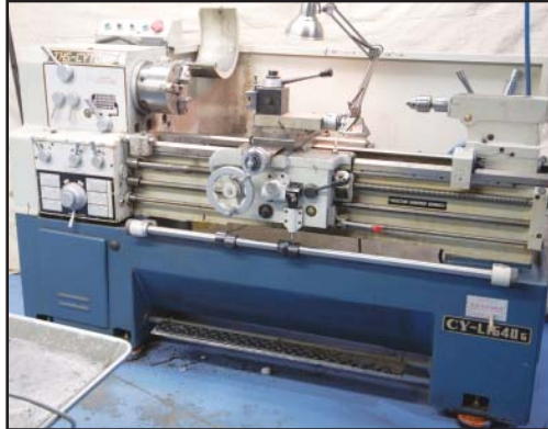
JHS CYTURN L16-40 gap bed engine lathe