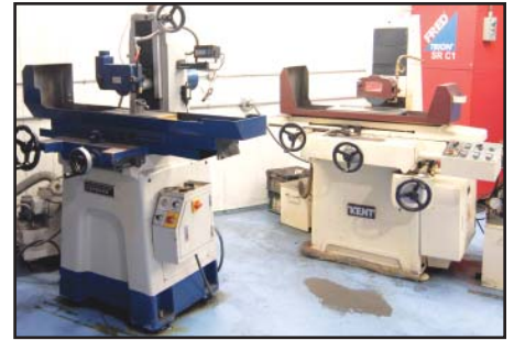
KENT & FORWARD surface grinders