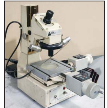
MITUTOYO TM 101 tool makers microscope