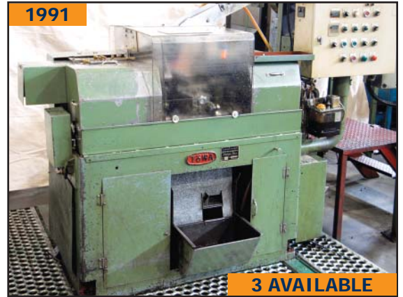
TOWA TO-3A pointer/shaver