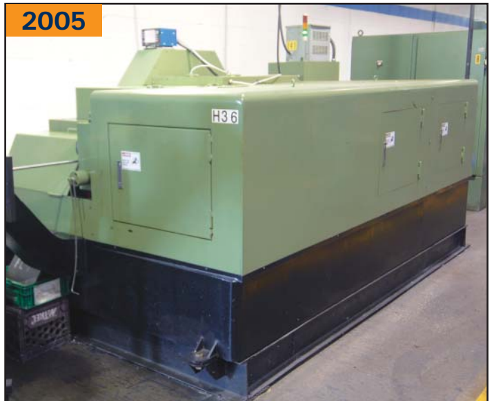
LIAN SHYANG LS-C-NF-14B6LS nut former