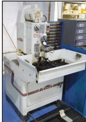
SUNNEN MBB 1660 honing machine