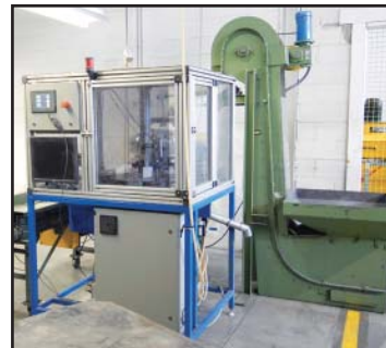
Automatic sorting station