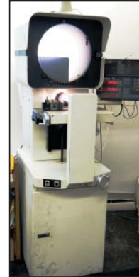
MICRO-VU SPECTRA 14" optical comparator