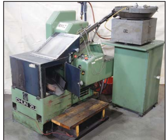
CHUN ZU DPR-5 thread roller