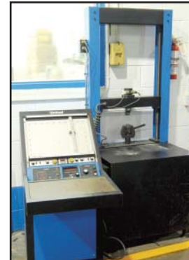
UNITED 20,000 lb. tensile tester