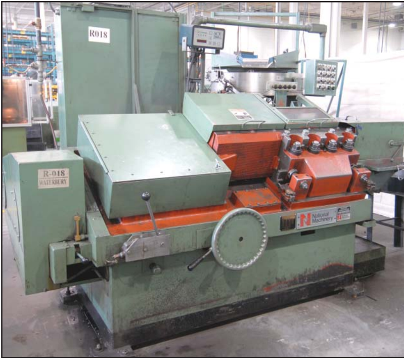
HARTFORD/NATIONAL 30-180V thread roller