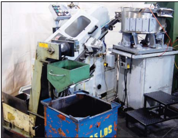
SANMEI 10-300 thread reader