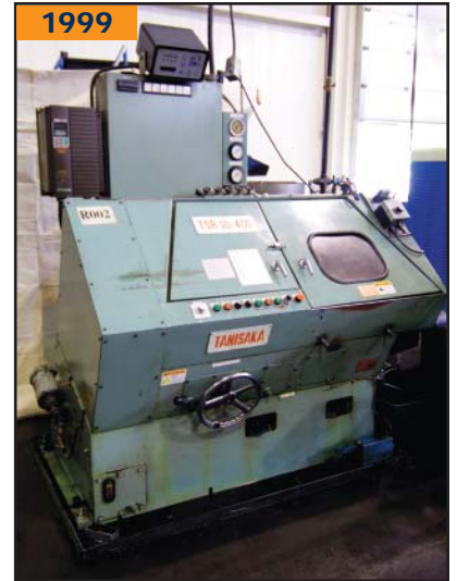
TANISAKA TSR10-400 HL thread roller