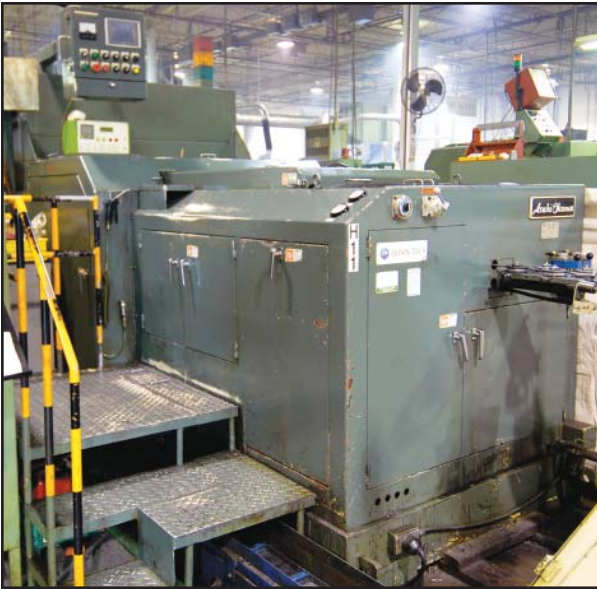
ASAHI OKUMA A0T 10B 2 die 2 blow cold header