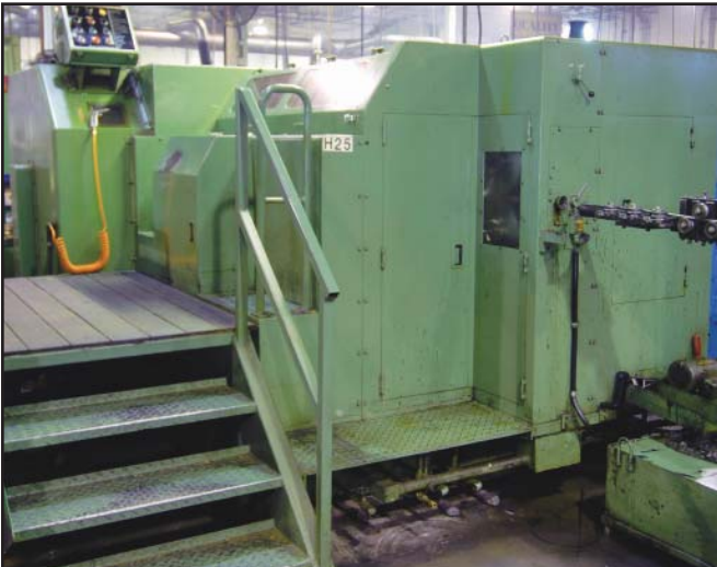
SAKAMURA S-340 3 die progressive cold header