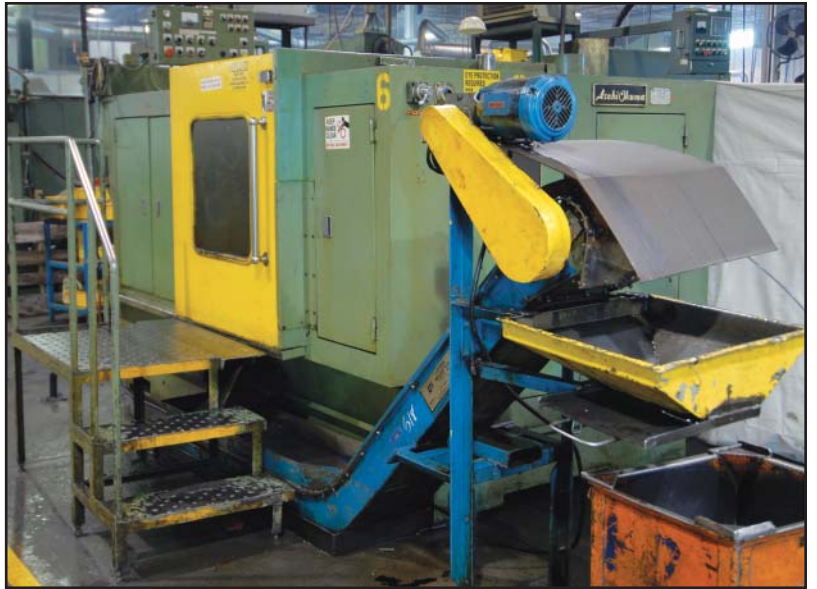
ASAHI OKUMA A0T 10B 2 die 2 blow cold header