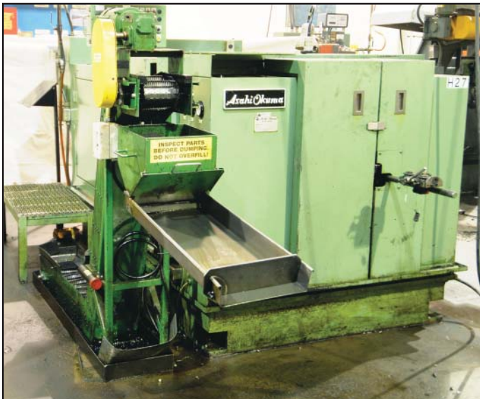
ASAHI OKUMA RH 60 2 die 3 blow cold header