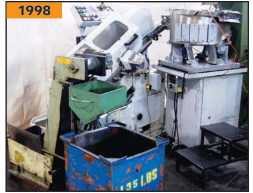
SANMEI THI-R875 thread roller