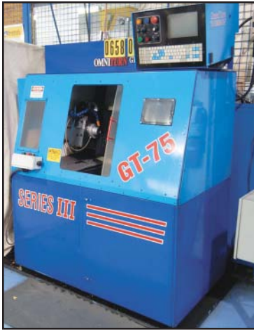
OMNITURN SERIES III GT-75 2 axis CNC turning centre