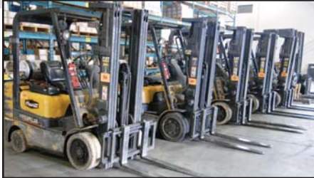
View of forklifts