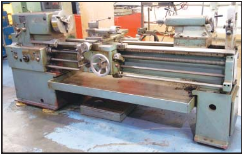
TOS SN50B gap bed engine lathe