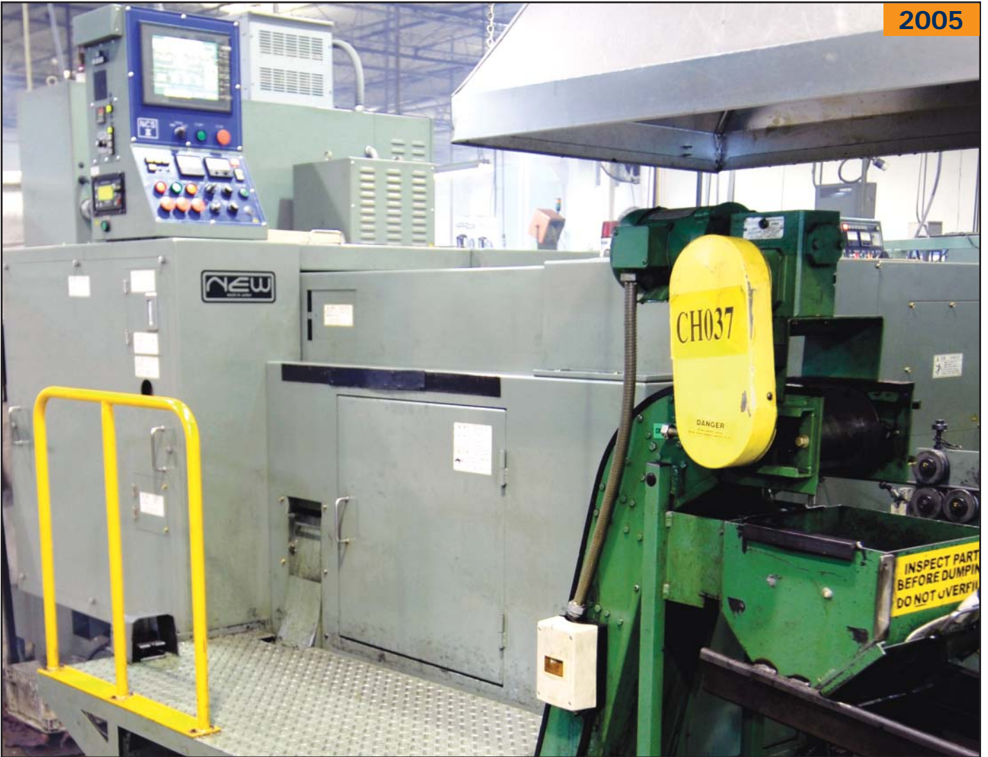
NAKASHIMADA MTS-308A 3 die 3 blow cold header