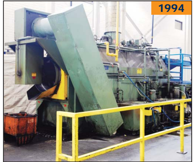
ACME FAB gas fired, 2 stage rotary drum washer