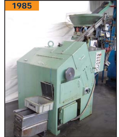
HILGELAND PN4B automatic pointing and rounding machine