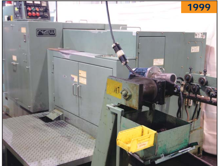
NAKASHIMADA NP81 2 die 3 blow cold header

MORE DETAILED LISTINGS AND PHOTOS www.corpassets.com