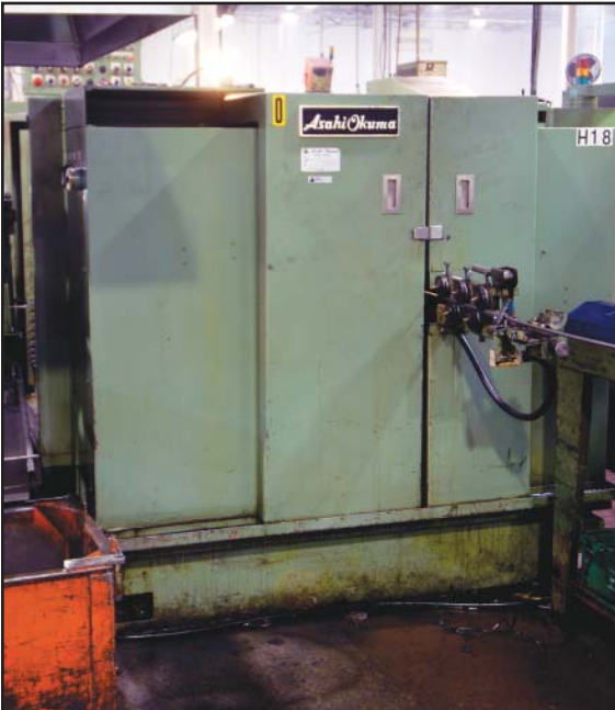
ASAHI OKUMA RH 80 2 die 3 blow cold header