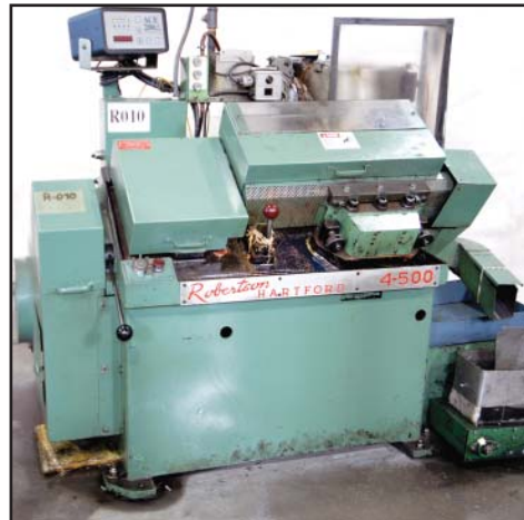
ROBERTSON/HARTFORD 4-500 thread roller