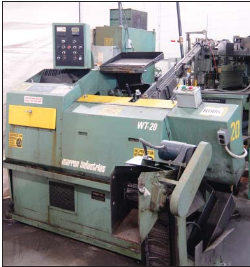
WARREN WT 20 thread roller