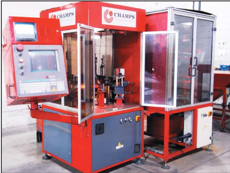
CHAMPS SLZ 350-84 automatic part sorting/inspection machine