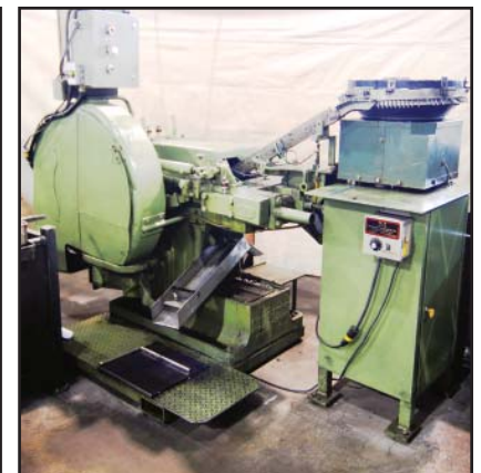
WATERBURY #1 trimmer