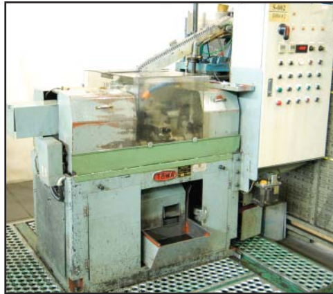
TOWA TO-4A pointer/shaver