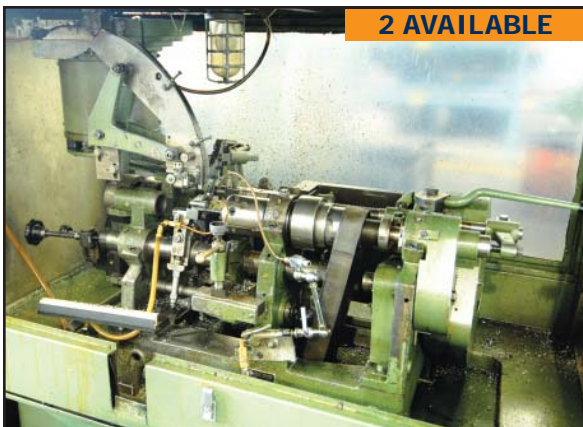
RORSCHACH F-A3 pointer/shaver