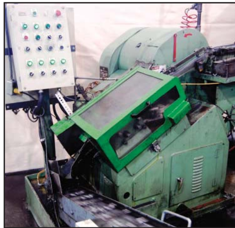
SANMEI THI-10R thread roller