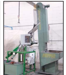
Automatic sorting station