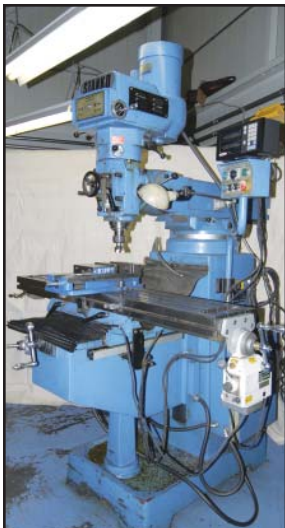
STANKO 5KHV vertical milling machine