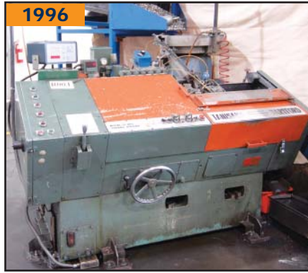
TANISAKA/HARTFORD 10-400 thread roller