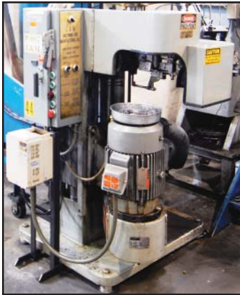
L&M 15 high speed pointer/shaver