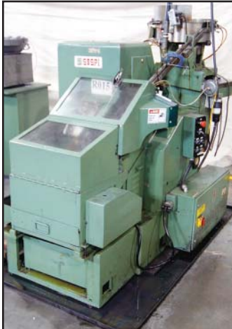
SASPI GV-1 thread roller