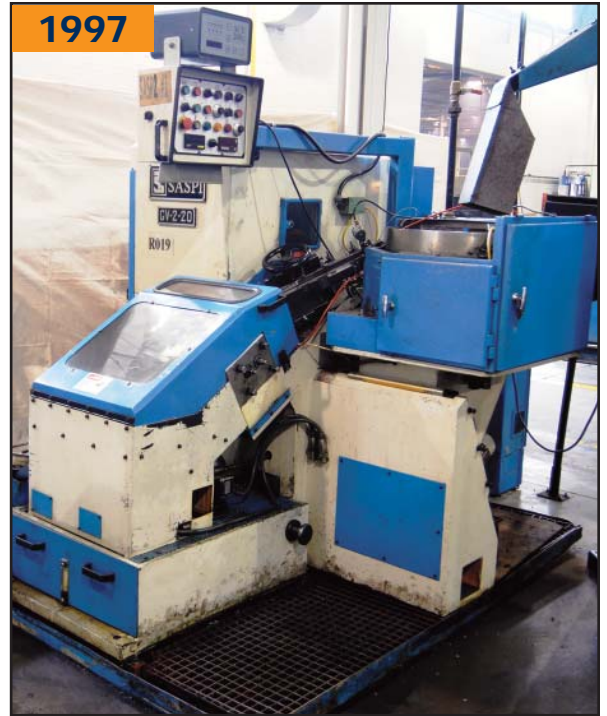
SASPI GV2- thread roller