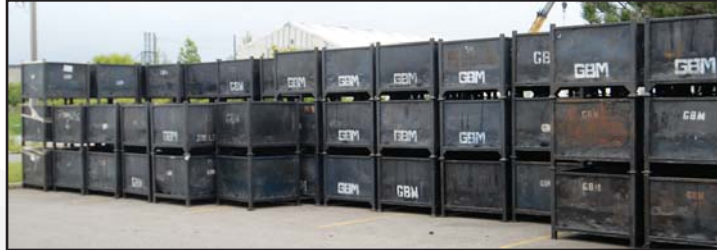
Large assortment of tote bins available