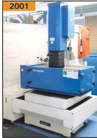
JSEDM CNC EA600L sinker type EDM