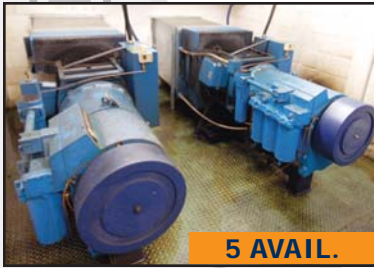
COMPARE 218 PAUS 50 hp HYDROVANE air compressors