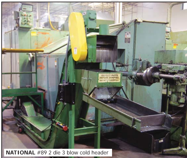
NATIONAL #89 2 die 3 blow cold header