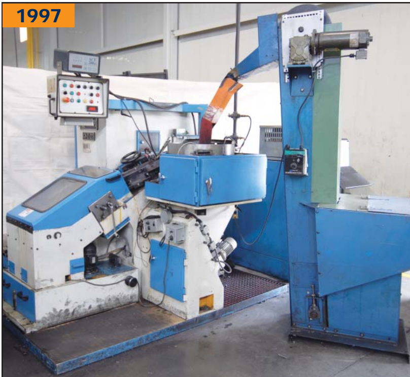
SASPI GV2- thread roller