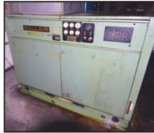
SULLAIR 12B-H50 50 hp rotary screw air compressor