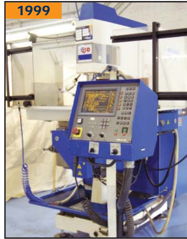
OSO FV 30 CNC vertical milling machine