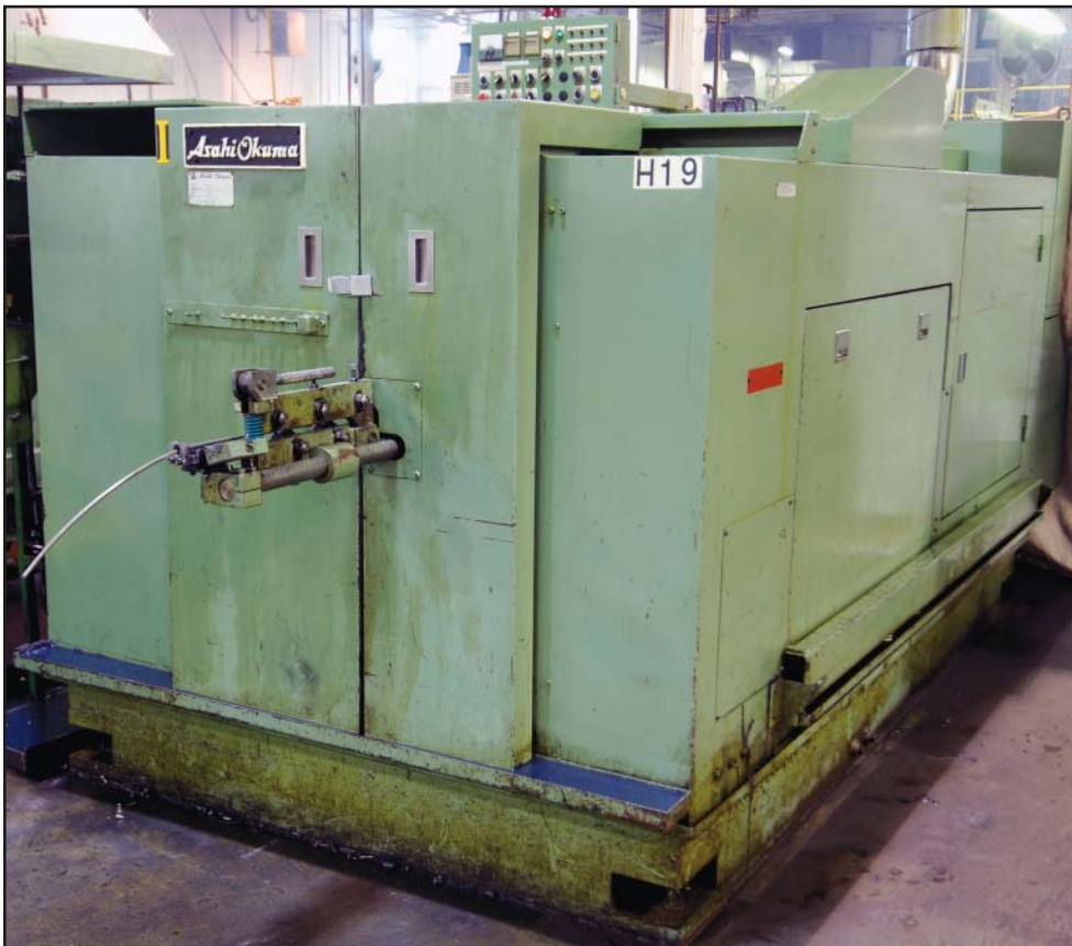
ASAHI OKUMA RH 80 2 die 3 blow cold header

YOSHARA G5LL reheader with 16 mm max shank dia., 60 mm max kickout stroke, 240 mm crank stroke, 35 PPM, 60 tons forging pressure, s/n 4138