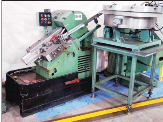
CHUN ZU DPR-8L thread roller