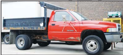
DODGE RAM 3500 flatbed truck