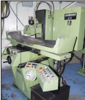
JAKOBSEN 6" x 18" hydraulic surface grinder