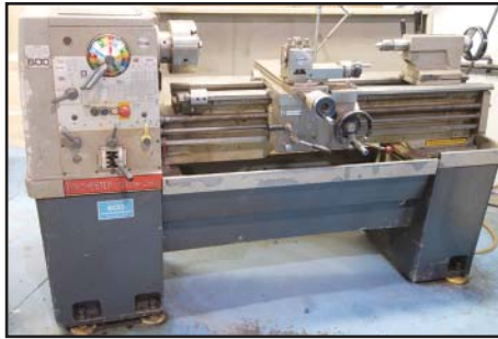
COLCHESTER MASTER 2500 engine lathe