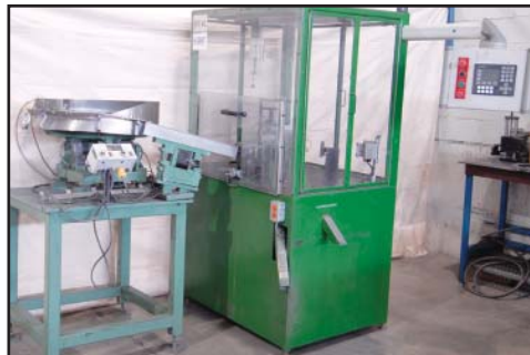
Automatic sorting station