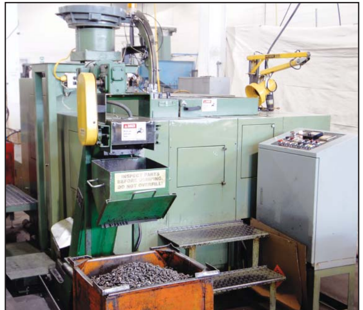
YOSHARA G5LL reheader