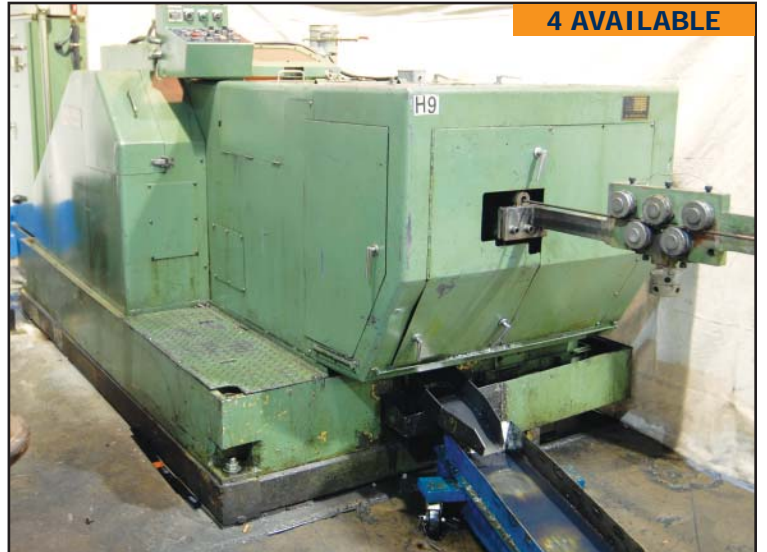
ITAMI UHS-8 DSSD high speed cold header