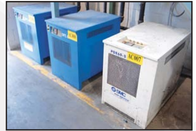
MAC & SCM air dryers