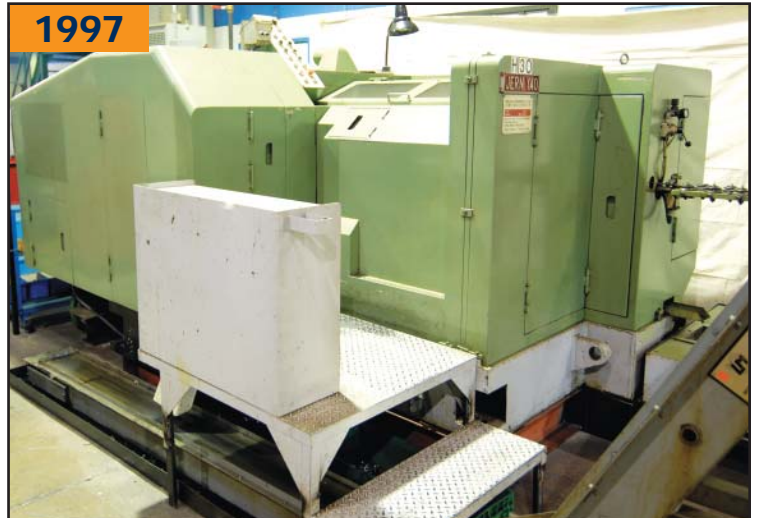
JERN YAO JNP-10B5S 5 die part former