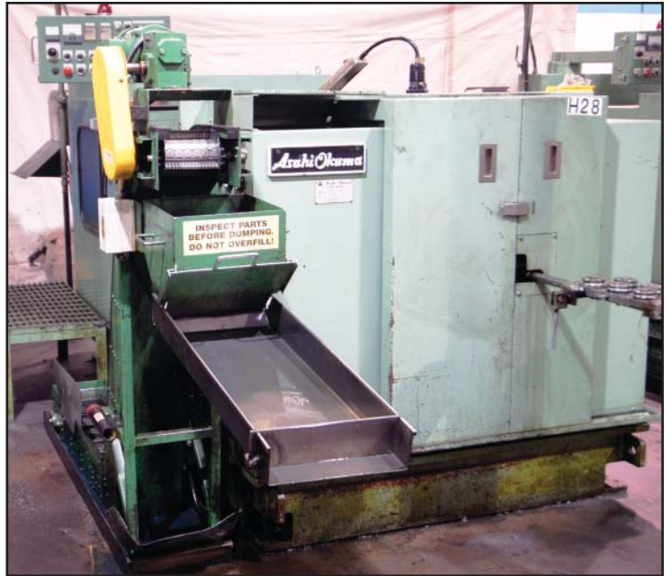
ASAHI OKUMA RH 60 2 die 3 blow cold header