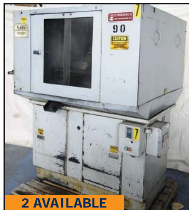
HP TOWNSEND 2 pointer/shaver