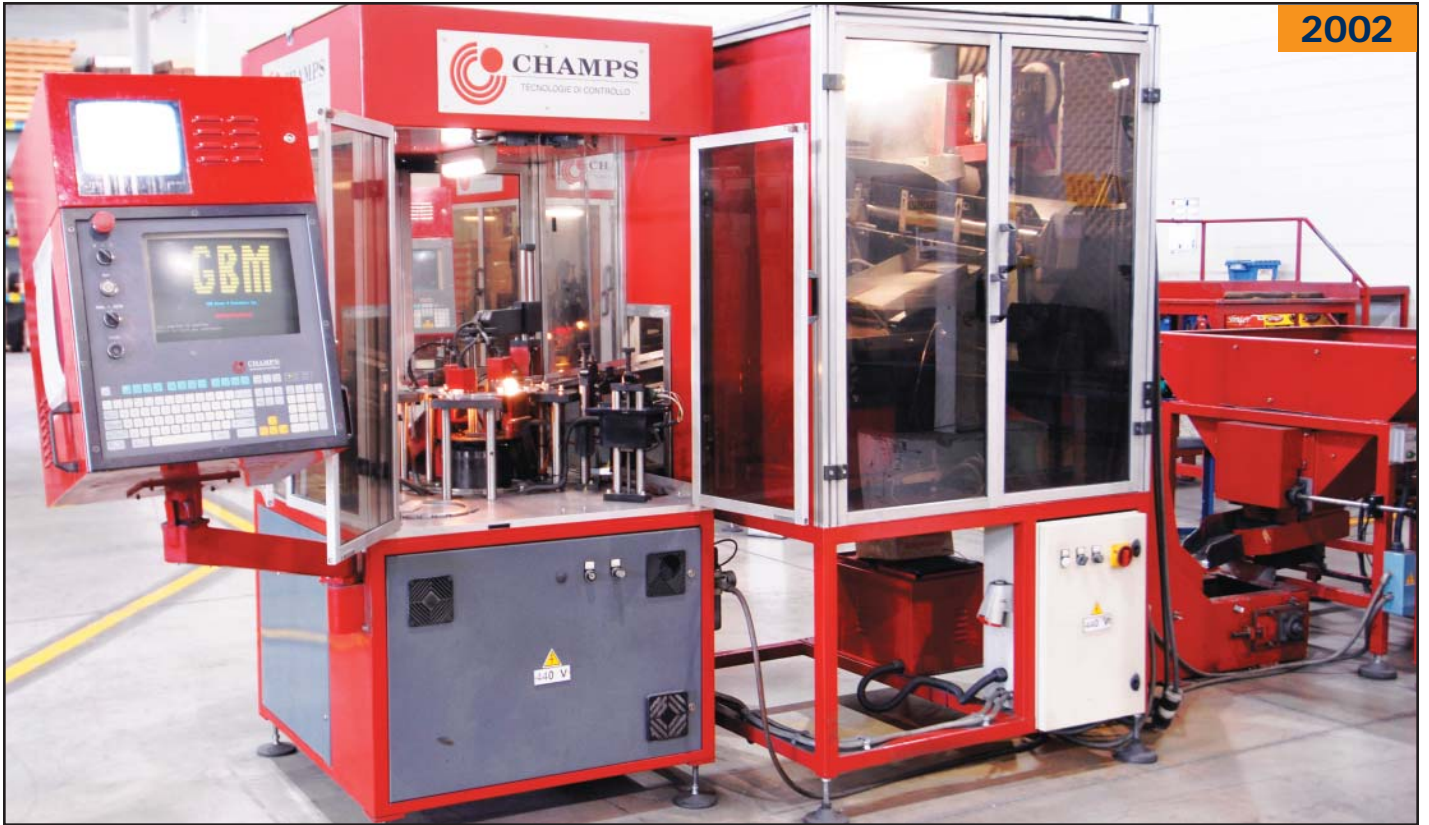
CHAMPS SLZ 350-84 automatic part sorting/inspection machine