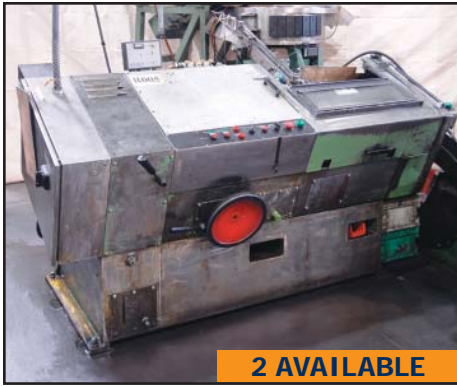
HARTFORD 10-400 thread roller