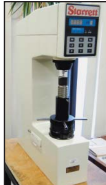
STARRET digital hardness tester