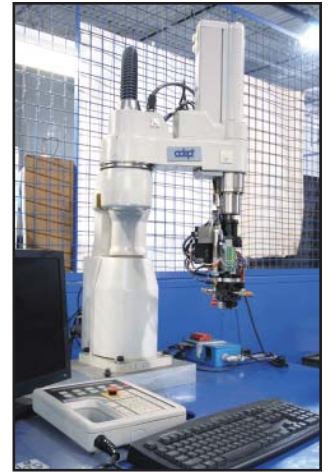
ADEPT 133 table top robot