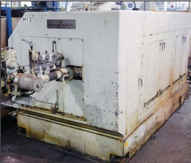
ITAMI PH-10 2 die 3 blow high speed cold header