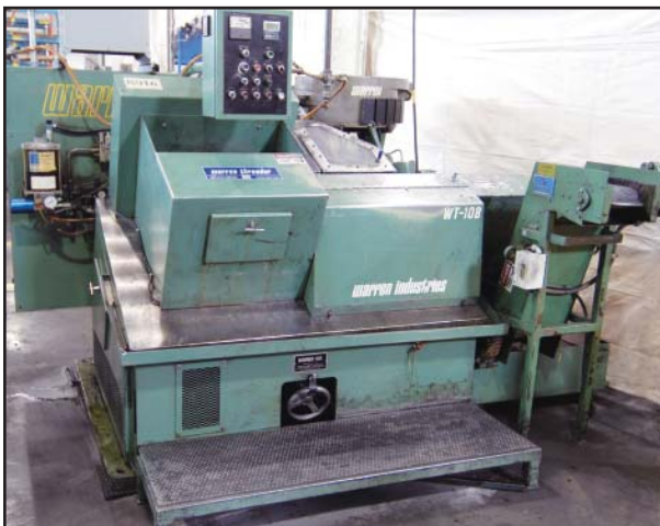
WARREN WT 10B thread roller