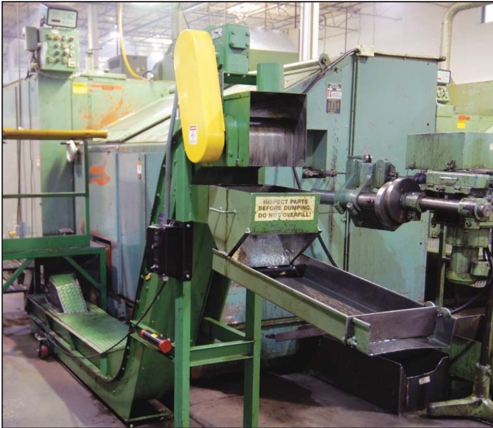
NATIONAL #89 2 die 3 blow cold header