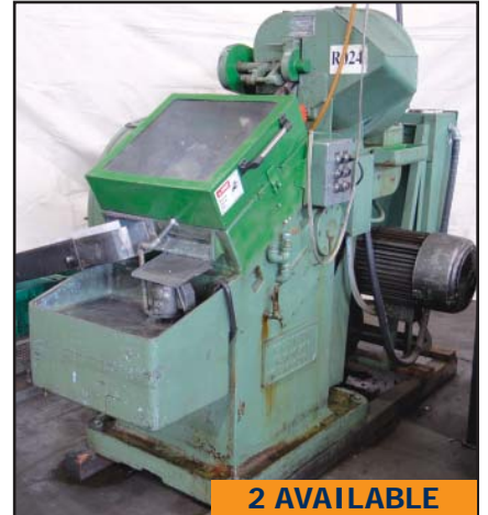
WATERBURY #10 planetary thread roller