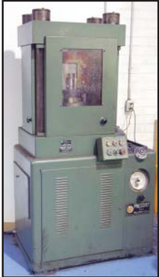
PRESSVIT T100 4 post hydraulic hobbing press