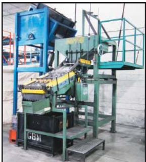
WARREN roller sorter