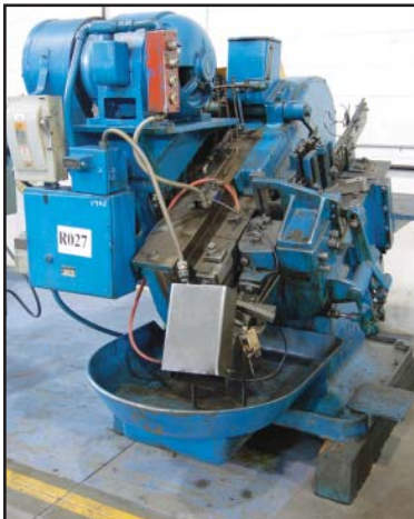
WATERBURY #20 thread roller