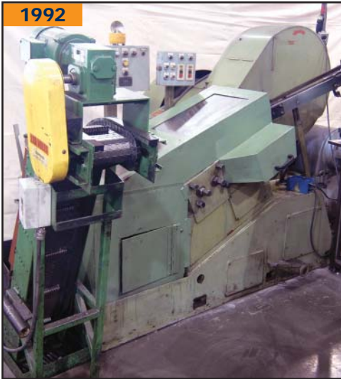
SANMEI THI-12R thread roller