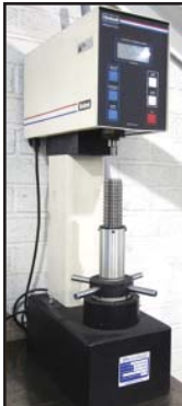
UNITED TRUE BLUE digital hardness tester