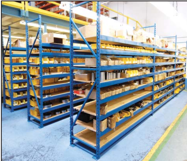
SPARE PARTS INVENTORY