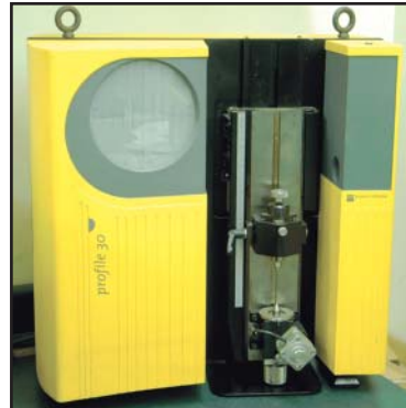
BROWN & SHARPE PROFILE 30 non contact measuring system