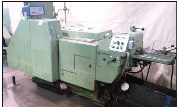
HARTFORD 5-250 DSSD cold header