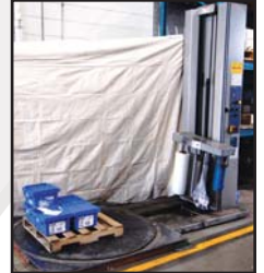
MULLER 2201 automatic pallet wrapper