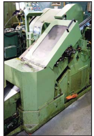
SANMEI THI-10R thread roller