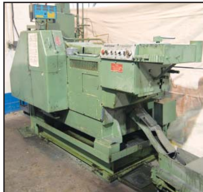
HARTFORD 5-450 1 die 1 blow cold ball header