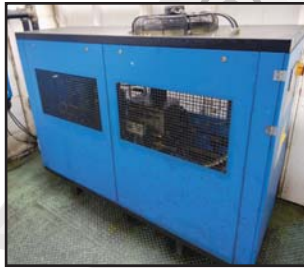
AIRTECH SC 500 air dryer