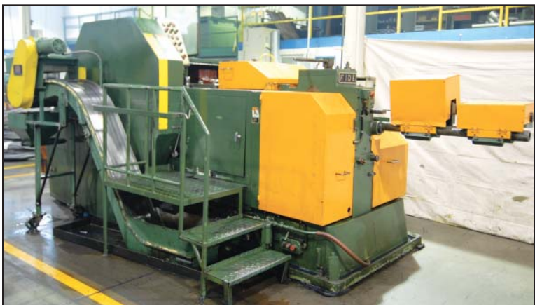
FIDE E 23 M 12 2 die 3 blow cold header