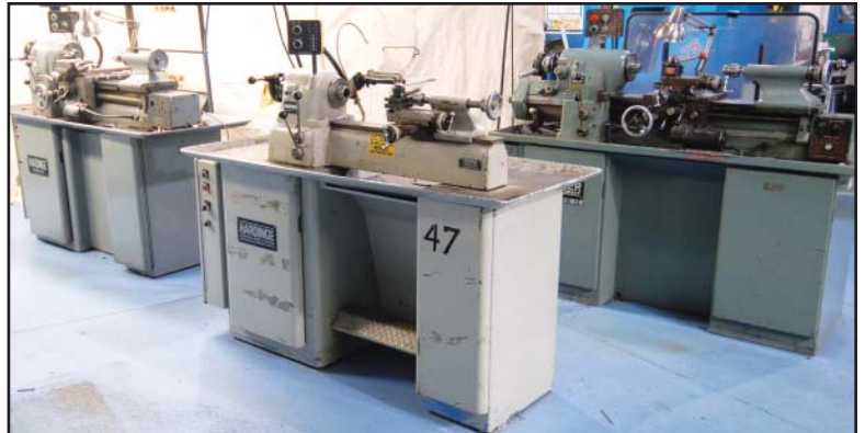
HARDINGE & FEELER precision tool room lathes