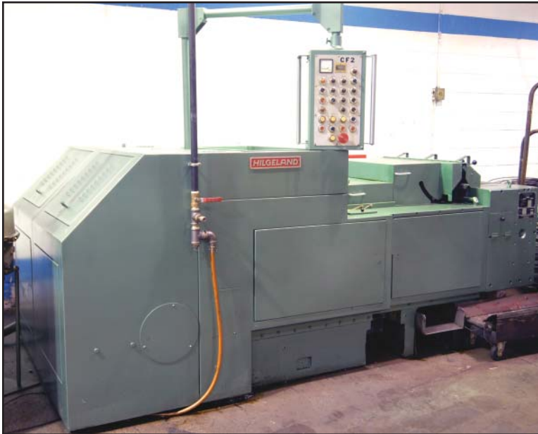
HILGELAND CF2AZ 2 die 3 blow cold header