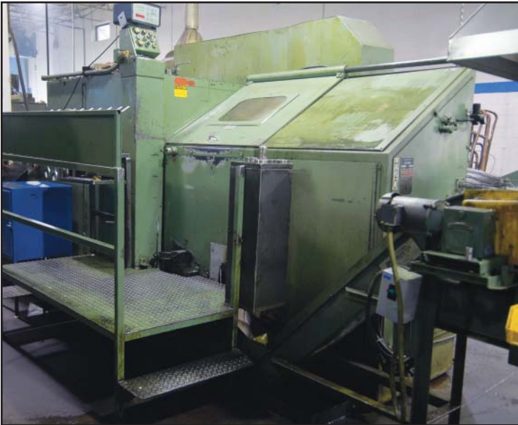
NATIONAL #68 DSSD high speed, medium stroke, cold header