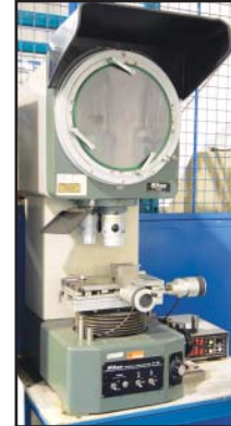
NIKON V12 optical comparator