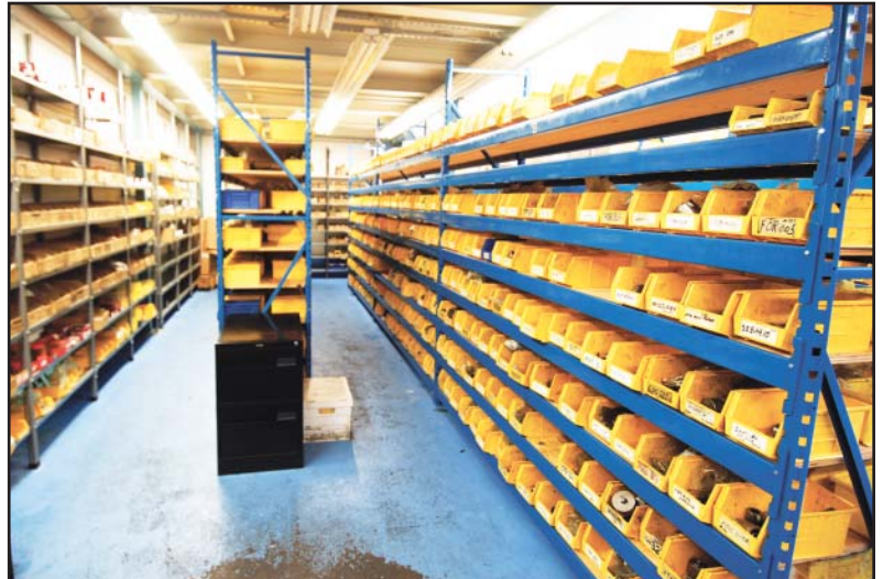
SPARE PARTS INVENTORY