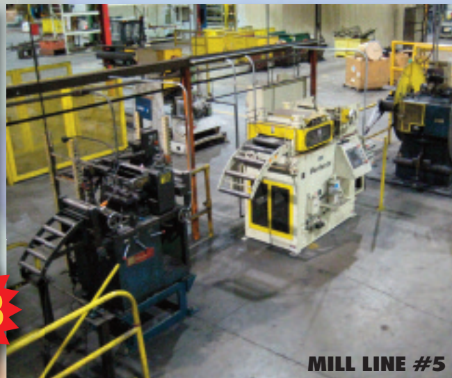
MILL LINE #5