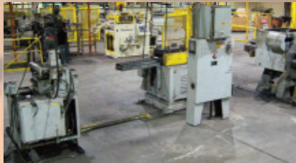
MILL LINE #2