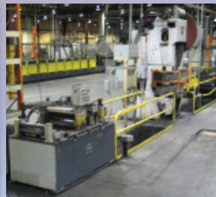
MILL LINE #4