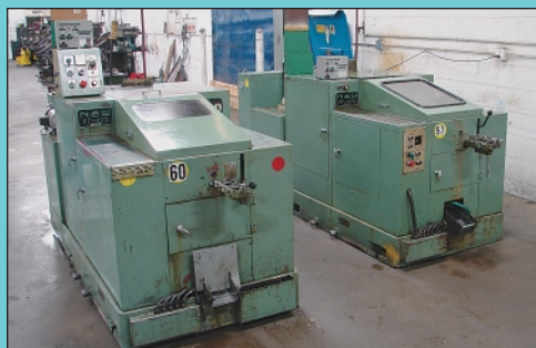
(5) 1/8" Nakashimada Model PF-420 Two-Die Three-Blow Multi Die Cold Headers