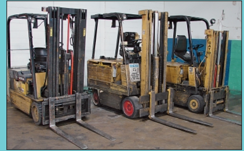
Partial View Electric Lift Trucks