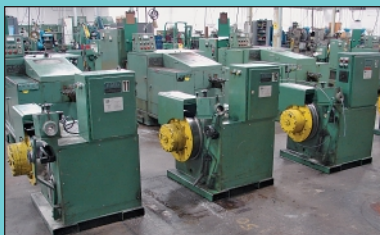
(41) Wire Drawers To 1/2" Capacity

Features: Upcoming Sale Information Liquidation & Equipment Section Email Auction Notification Recent Auction Results Lot Catalog Listings Photo Galleries Downloadable Forms Complete Terms of Sale Staff Profiles Reference Information