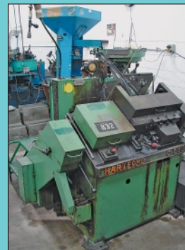
(8) 3/16" Hartford Model 0-500 High Speed Thread Rolling Machines