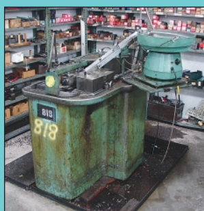
3/16" Hartford Model 190 Thread Rolling Machine