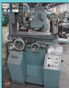
6" X 18" Harig Model Super 618 Surface Grinder