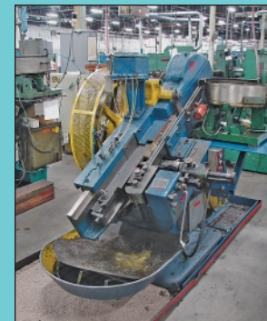
1/2" Waterbury Farrel Model #30 Inclined Mid Frame Thread Rolling Machine