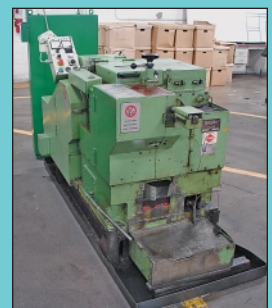
(5) 1/8" Carlo Salvi Model RF/SV High Speed Tubular Rivet Single Die Cold Headers