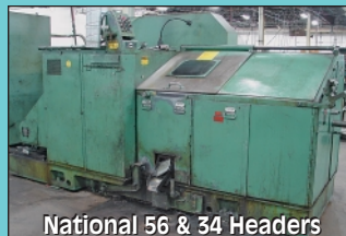
National 56 & 34 Headers

2020 DUNLAP ST., CINCINNATI, OHIO 45214 PHONE (513) 241-9701 / FAX (513) 241-6760 INTERNET: cia-auction.com