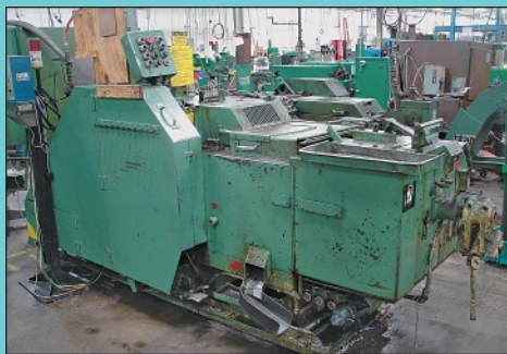
(2) 1/4" National Model 34 Two-Die Three-Blow Multi-Die Cold Headers