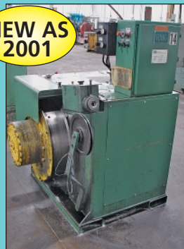
NEW AS 2001 Close Up View (1 of 30) Late-Model RMG Wire Drawers To 3/8" Capacity