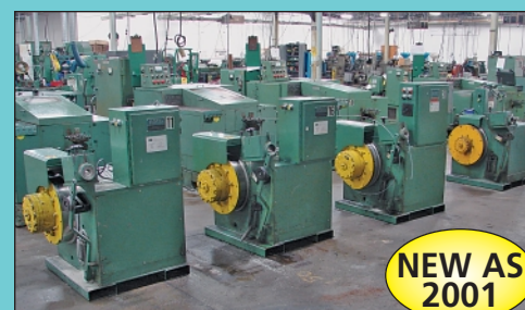
(17) 3/16" RMG Model 34 Wire Drawers