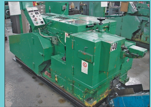
(3) 3/16" Carlo Salvi Model RF/476/SV High Speed Tubular Rivet Single Die Cold Headers

(2) 3/16" Fastener Engineering Model WR-01-16 Wire Drawers; w/ 16" Capstans, New 1976 & 1977, S/Ns 7762426 & 12772482