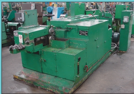
11/32" Carlo Salvi Model RF/873/SV High Speed Tubular Rivet Single Die Cold Header