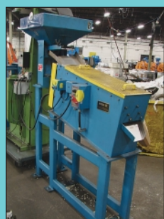
Warren Model WL-1000 Incline Loading Conveyor