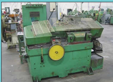
1/2" Hartford Model 20-225 High Speed Thread Rolling Machine