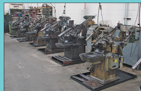
(5) 1/4" Waterbury Farrel Model #10 Inclined Heavy Frame Thread Rolling Machines