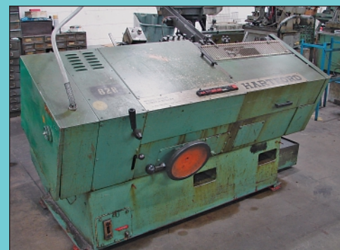
3/8" Hartford Model 10-400 High Speed Thread Rolling Machine

McKenzie Electric Floor Type Chip Separator; S/N E626