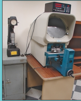
14" Deltronic Model DH-14 Bench Type Optical Comparator