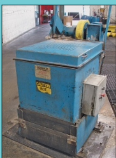
Atotech Electric Parts Spin Dryer