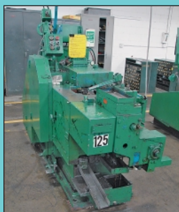
3/16" National High Speed Single Die Cold Header