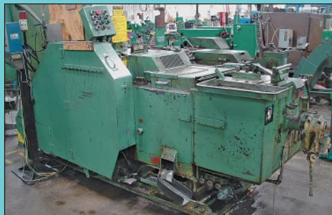
(2) 1/4" National Model 34 Two-Die Three-Blow Multi-Die Cold Headers