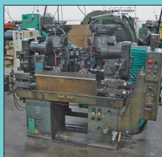
Partial View (1 of 5) Universal Automatic Drilling and Tapping Machines