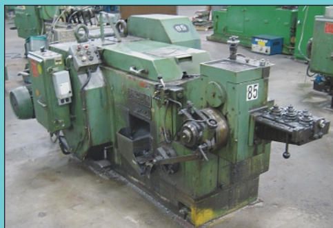
5/16" Sacma Model SP-21 High Speed LONG STROKE Single Die Cold Header