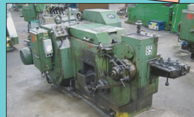
5/16" Sacma Model SP-21 High Speed LONG STROKE Single Die Cold Header