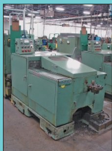
(2) 1/4" Nakashimada Model PF-630 LONG STROKE Two-Die Three-Blow Multi Die Cold Headers