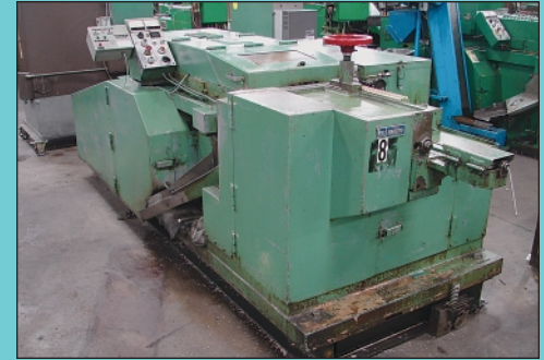
(2) 1/4" Carlo Salvi Model RF/635/SV High Speed Tubular Rivet Single Die Cold Headers