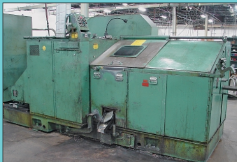
3/8" National Model 56 Two-Die Three-Blow Multi-Die Cold Header

Bidspotter.com™ Select Items of Major Machinery to be Offered Via "Live Internet Bidding" at BidSpotter.com See Instructions on Page 2 To Become a Qualified Bidder on the Internet