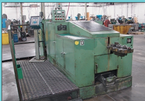
5/16" Nakashimada Model PF-860 Two-Die Three-Blow Multi Die Cold Header

Featuring: (21) Multi-Die Cold Headers to 1/2" Cap., (39) Single Die Cold Headers to 11/32" Cap., (41) Wire Drawers to 1/2" Cap., (29) Thread Rollers to 1/2" Cap., (4) Slotters to 1/4" Cap., Butt Welders, Wire Heaters, Huge Quantity Header Tooling, Pace Sorting Machine, Parts Handling Equipment, Secondary Machines, Parts Washers, (5) Lathes, (6) Surface Grinders, Tollroom Machinery, Misc. Machinery, Inspection Equipment, (6) Lift Trucks, Huge Quantity Shop & Support Equipment, Late Model Office & Computer Equipment