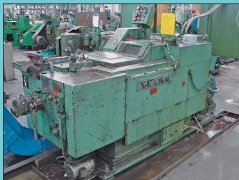
(2) 1/4" National Model 34 Two-Die Three-Blow Multi-Die Cold Headers