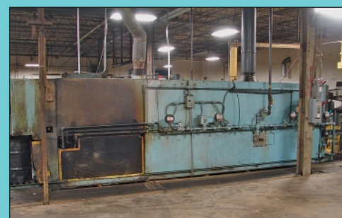
Jensen Model 8413 Gas Fired Three-Stage Rotary Drum Parts Washer