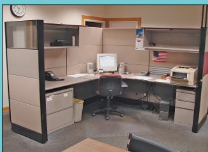
Partial View Late Model Office Equipment