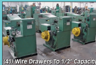
(41) Wire Drawers To 1/2" Capacity