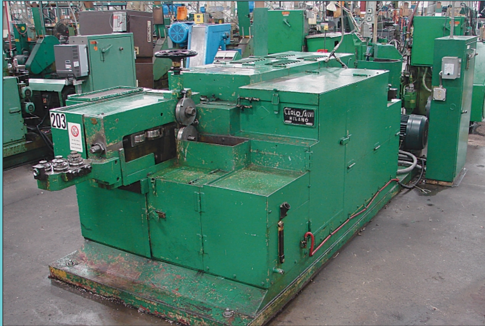
11/32" Carlo Salvi Model RF/873/SV High Speed Tubular Rivet Single Die Cold Header