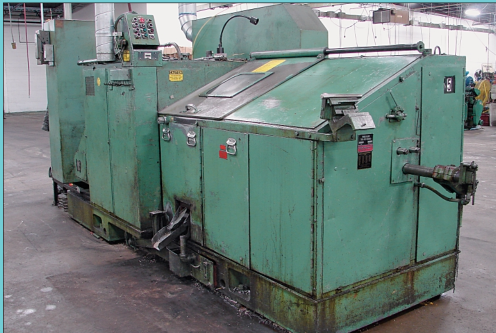
3/8" National Model 56 Two-Die Three-Blow Multi-Die Cold Header