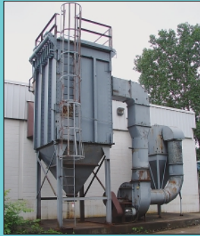
(2) 50 HP AAF Model Fabri-Pulse Dust Collection Systems