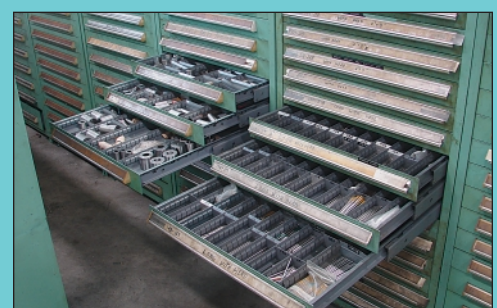
Partial View Huge Quantity (20) Vidmar Tooling Cabinets Loaded With Header Tooling