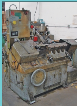
5/16" Hartford Model 10-300 High Speed Thread Rolling Machine