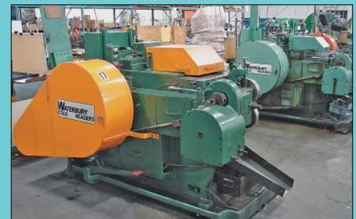
(5) 5/16" Waterbury Farrel "Hipro" Single Die Cold Headers