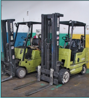
Bank View Clark LP Gas Lift Trucks