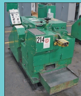
(5) 1/8" Carlo Salvi Model RF/SV High Speed Tubular Rivet Single Die Cold Headers