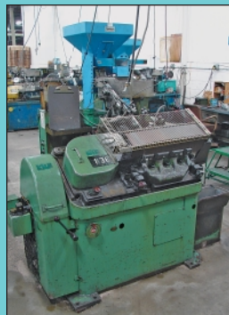
(4) 3/16" Hartford Model 0-400 High Speed Thread Rolling Machines