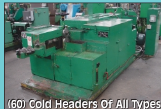
(60) Cold Headers Of All Types