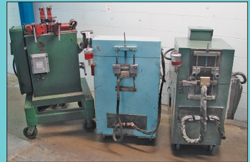
Overall View Wire Heaters and Butt Welders

Large Quantity Computer / Office Equipment & Furniture Consisting of; Xerox Model 250 Blueprint Copier, (12) Dell Desk Top PC Systems, 8-Person Hayworth Modular Office System w/ Cabinets, Overhead Laterals, Lights and Letter Files, (50) 4 and 5 Drawer Letter Files, 2-Door Storage Cabinets, D.P. Desks, Executive Desk Sets w/ Bookcases and Credenzas, Office Tables, Reception Furniture, 4-Drawer Lateral Files, Office Chairs, Folding Tables and Many Other Related Items