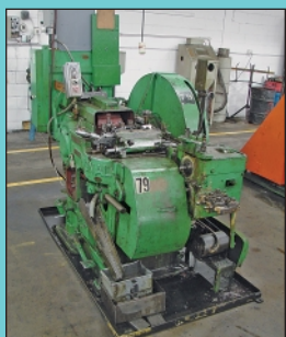
3/16" National Four-Die Progressive Multi Die Cold Header