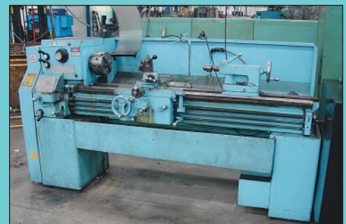
16" X 60" Leblond Geared Head Engine Lathe