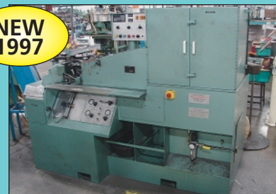
Automation Associates / Pace Model 500 Optical Sorting Machine