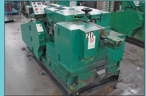
(3) 3/16" Carlo Salvi Model RF/476/SV High Speed Tubular Rivet Single Die Cold Headers

(5) 3/16" National Tubular Rivet Headers Single Die Cold Headers; (New as 1972), 1" Max Shank Length, 225 PPM, Equipped w/ Bushing Cut-Off, Stripper Mechanism on Some, Some Machines Were Set Up to Run Solid Parts & Some Set Up for Tubular Parts, S/Ns 36201, 36652, 36133, 36204, & 36662