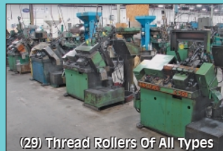
(29) Thread Rollers Of All Types