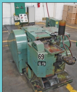
5/32" Carlo Salvi Model RF/PL High Speed Tubular Rivet Single Die Cold Header