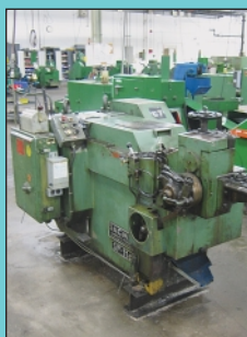
1/4" Sacma Model SP-11C High Speed Single Die Cold Header