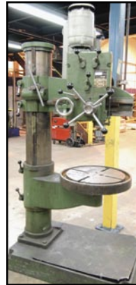
ESSBECO 2' radial arm drill