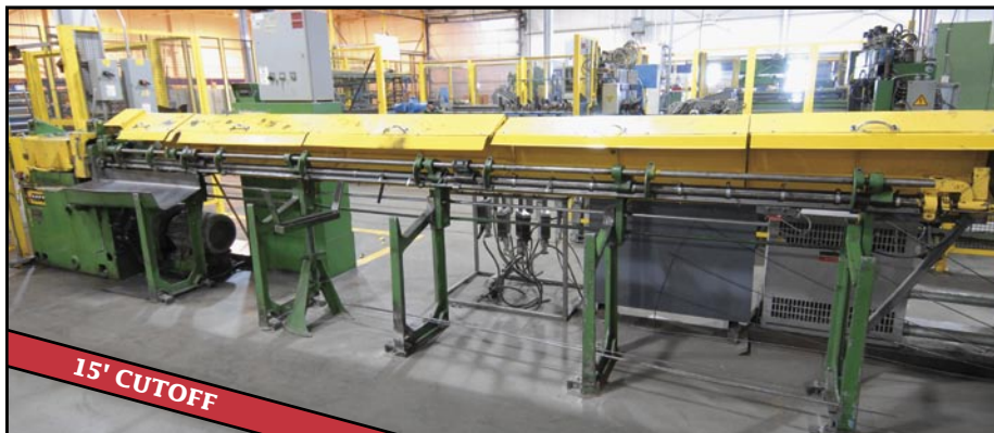
WAFIOS R 3 1.5mm to 7.0mm wire straightening & cutting machine