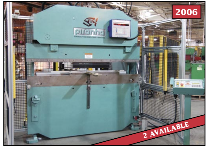
PIRANHA 35-GP 35 ton CNC hydraulic press brake