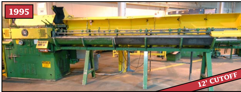
LEWIS 35V8 .156 to .375 wire straightening & cutting machine