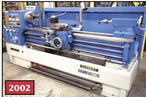
DARBERT CY-5 1760 tool room lathe