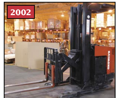
RAYMOND EASR45II, 4,500 lb. reach truck