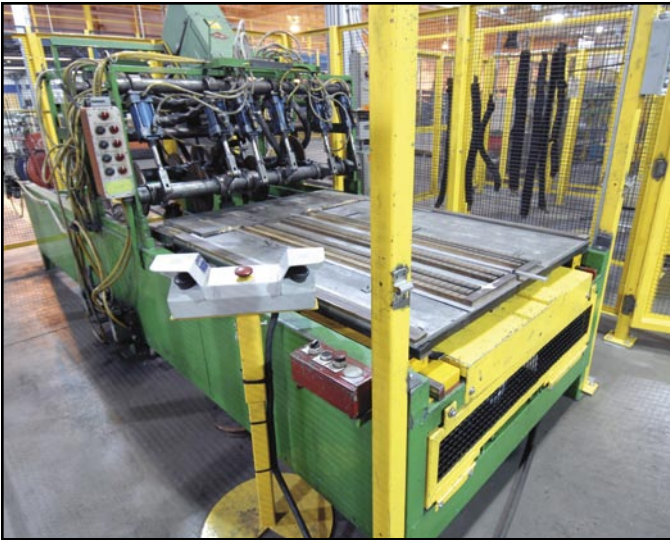
CUSTOM double shaft roller welder