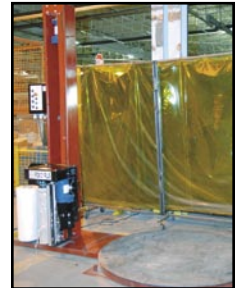
FOX G1 plus stretch wrapping machine