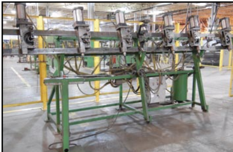
CUSTOM 3/8" head frame bender