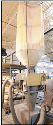
DUSTKOP dust collector