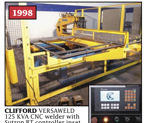
CLIFFORD VERSAWELD 125 KVA CNC welder with Sutron BT controller inset