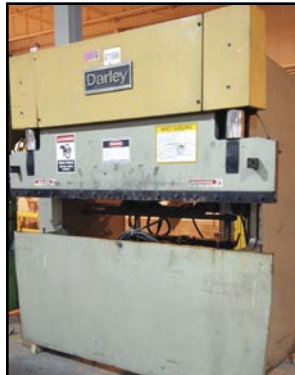
DARLEY EHP35 20/15 35 ton hydraulic press brake