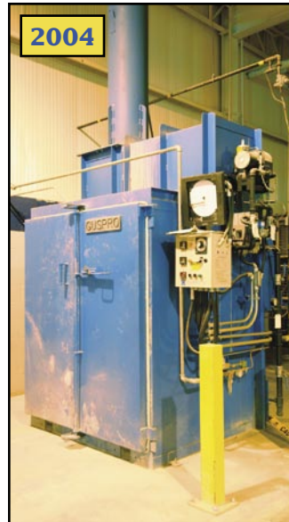
GUSPRO cleaning oven