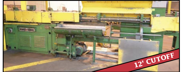
WAFIOS RF 41 HS .120 to .395 wire straightening & cutting machine