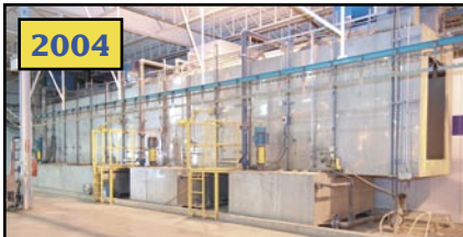
AUTOMATED JETTING SYSTEMS 5 stage wash