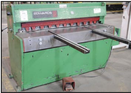
EDWARDS D-O 60" x 10 gauge shear