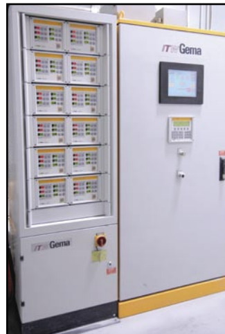
View of ITW GEMA controls