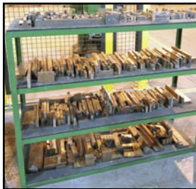
View of welder tooling