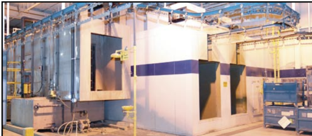
View of dry-off oven