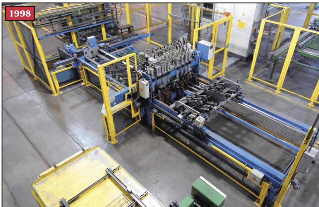
IDEAL GA 212 10 head mesh welder

For further information contact us at: 2 St. Clair Ave. W., Suite 1002, Toronto, Ontario, Canada M4V 1L5 Tel: (416) 962-9600 Fax: (416) 962-9601 Email: info@corpassets.com Web: www.corpassets.com Toronto • Montreal • Chicago