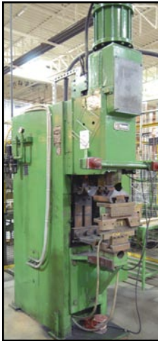
F-H WELDING ERC 12-150 press type welder