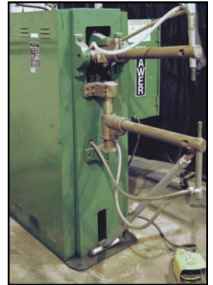
MAWER 75 KVA rocker arm welder