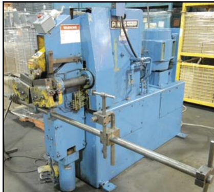
PINES 3T vertical tube bender

EDWARDS D-O hydraulic squaring shear with 60" x 10 gauge cap., s/n 823880332