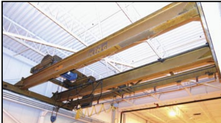
G.W. KING 3 ton twin girder overhead crane