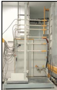
View of guns