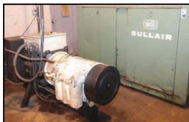
View of SULLAIR 75 HP compressor and COMPAIR 50 HP compressor