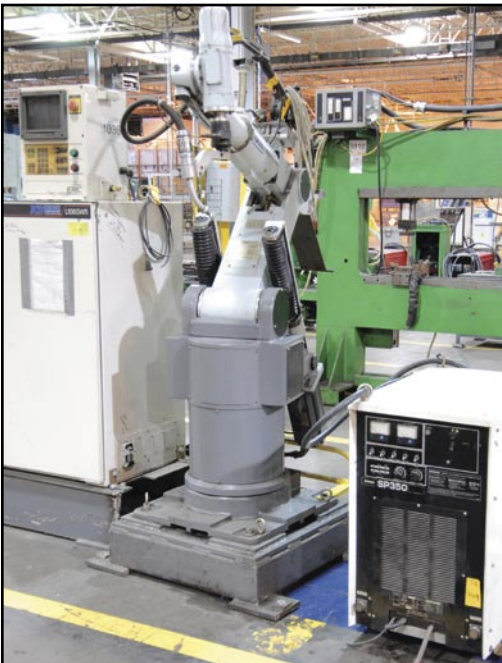
YASNAC ERC U065WS robotic mig welder