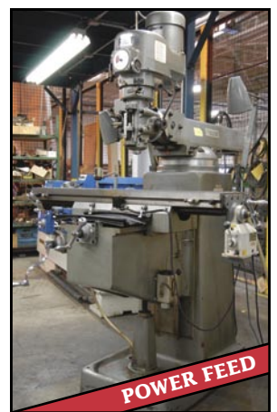
FIRST LC185VS ram type mill