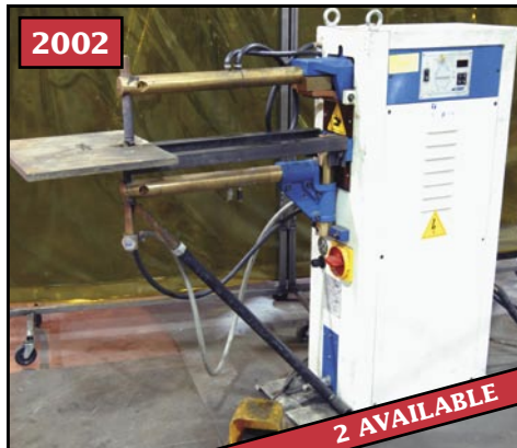
LECCO NKLP 50 KVA rocker arm welder