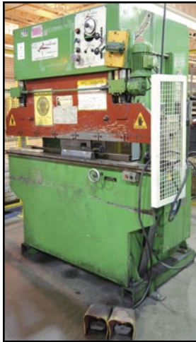
FARINA PFO/B/20 20 ton hydraulic press brake