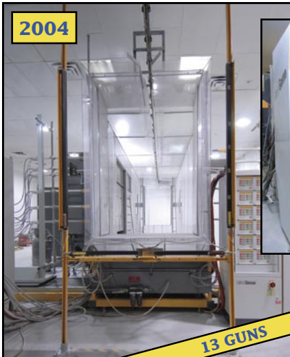
ITW GEMA powder coating line