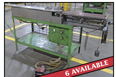
Pneumatic index bender