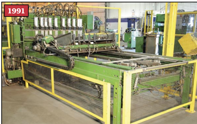
IDEAL GA 212 10 head mesh welder

This brochure is only a partial listing. VISIT OUR WEBSITE FOR