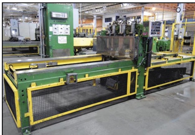
IDEAL GA 200-36 6 head mesh welder