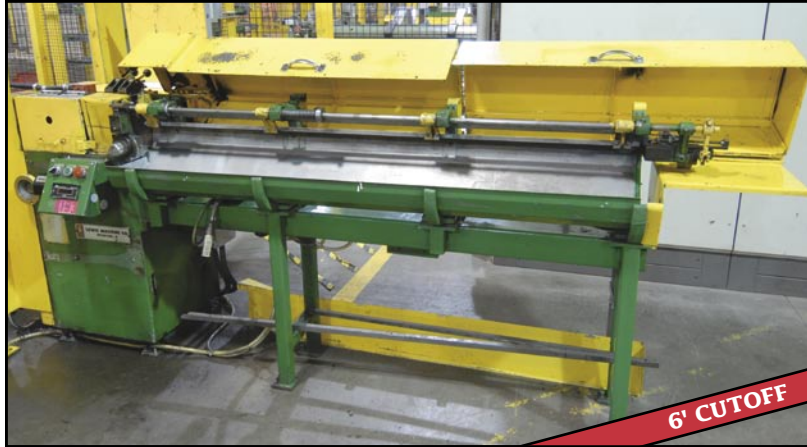
LEWIS 1SHV HS .031 to .135 wire straightening & cutting machine