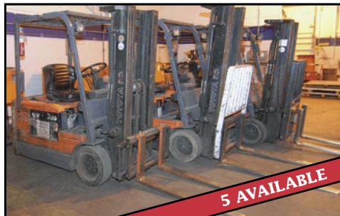
View of TOYOTA 5FBEC15 3,200 lb. forklift