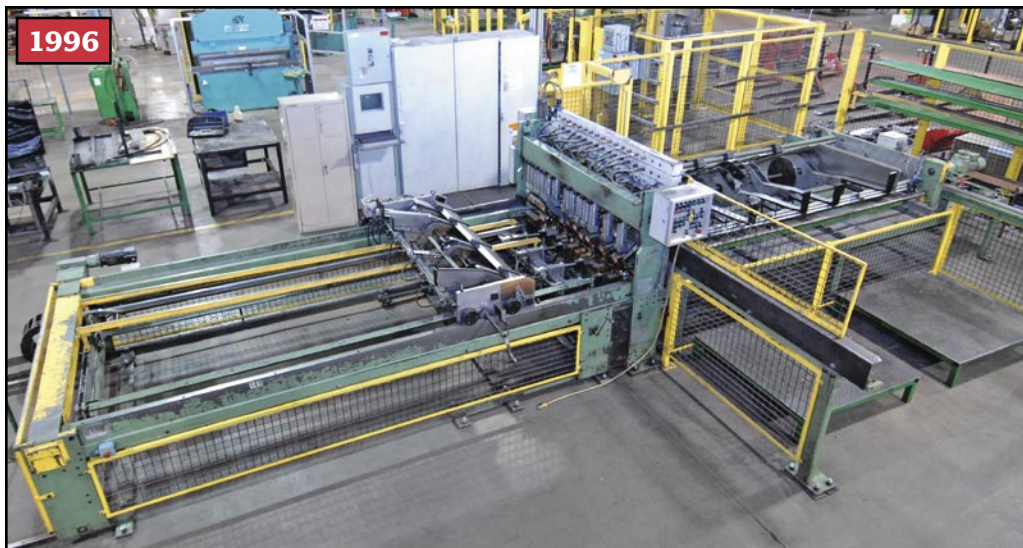
IDEAL GA 516 14 head mesh welder