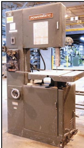
POWERMATIC 87 vertical bandsaw