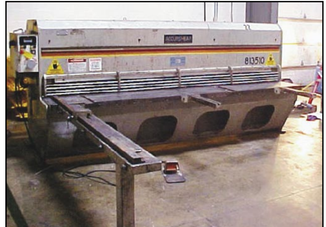
ACCUR SHEAR 10' x 10 gauge shear