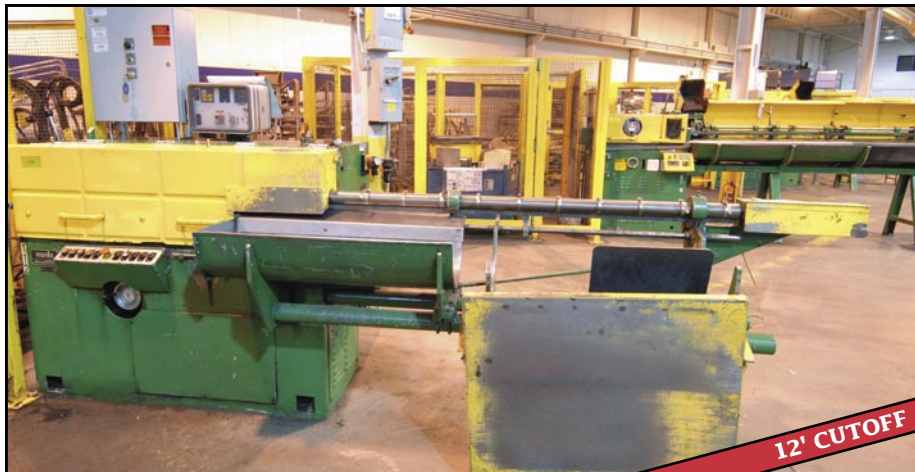
WAFIOS R 31 1.5mm to 7.0mm wire straightening & cutting machine

PATTERSON 2A .062 to .250 wire dia. 8' cutoff