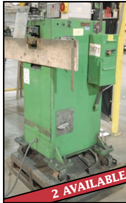
LORRS 130 BW 30 KVA butt welder

POWERMATIC MILLRITE ram type mill with 7" x 30" table, 75 to 1,080 RPM, s/n 74-4-65