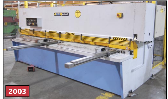
FABMASTER S1025 10' x ¼" cap. squaring shear