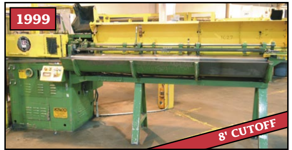
LEWIS 25 V5 HS .062 to .312 wire straightening & cutting machine