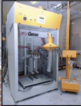
View of ITW reclaim