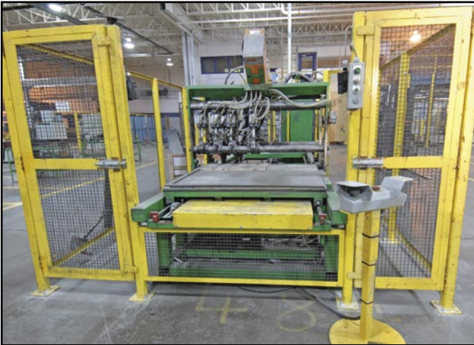
CUSTOM double shaft roller welder