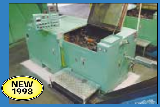
(2) 6MM Asahi Sunac Model AT-675 Long Stroke Transfer Headers