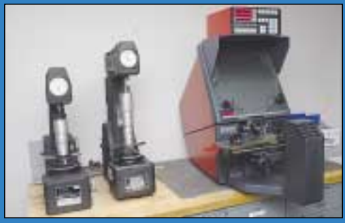
Partial View Late Model Inspection Equipment