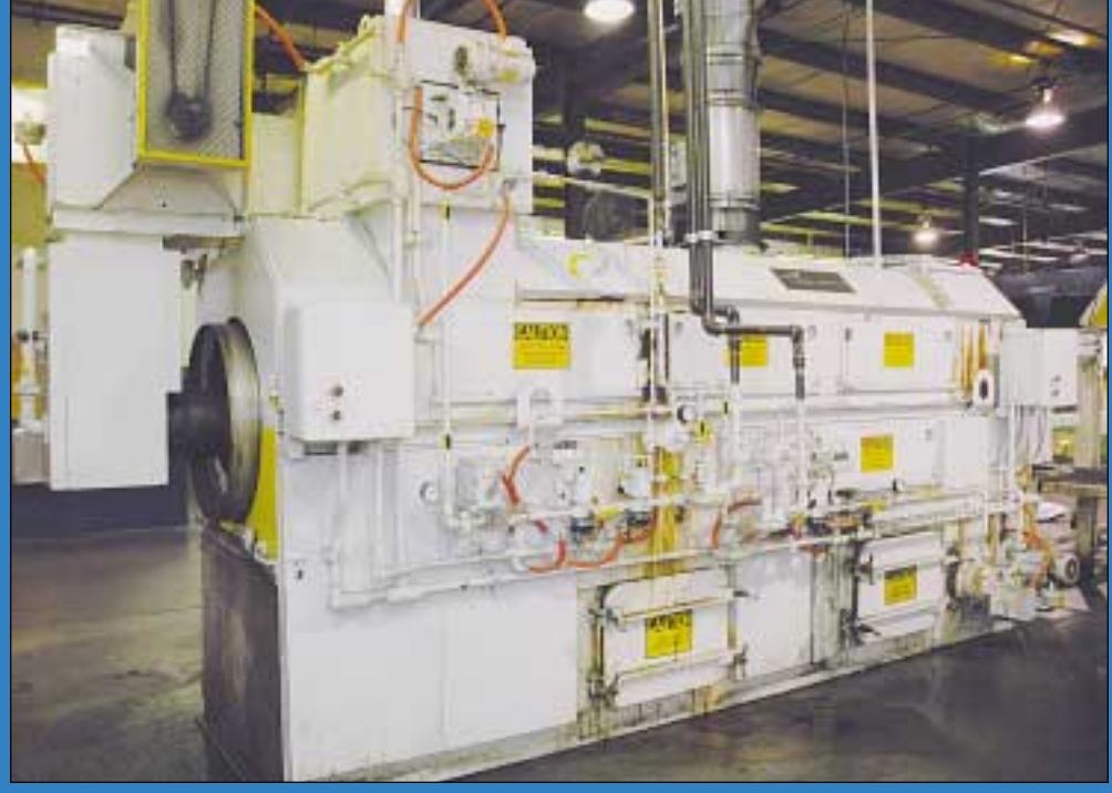
30" Dia. CAE Ransohoff "Pro-Clean" Base Tumble Drum Parts Washer