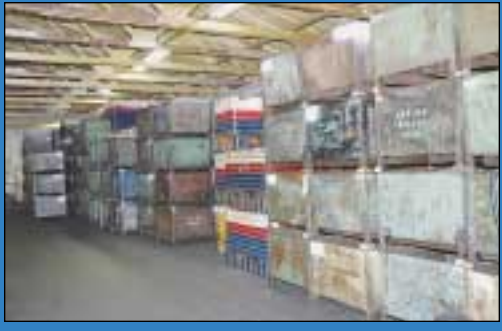
Partial View (700+) Assorted Style Steel Tubs