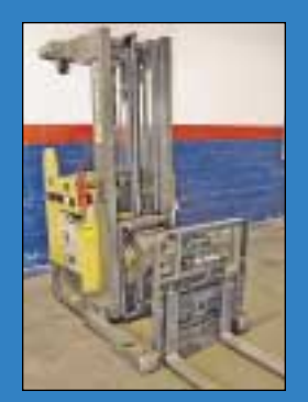
4,000 LB Caterpillar Model NRR40 Stand-Up Electric Lift Truck