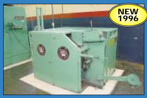
1/2" F.E. Model DTVA-2075-36 In-Line Wire Drawer