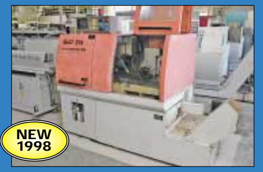
Gildemeister Model GLD 25L-5A CNC Swiss Type CNC Turning Center