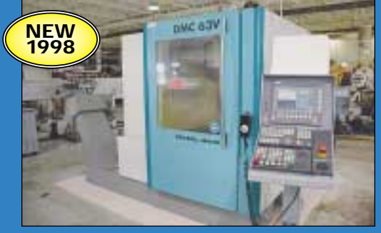
Deckel Maho Model DMC-63V CNC Vertical Machining Cente