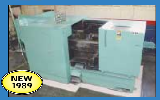
1/2" Asahi Okuma Model AOT-12L Two-Die Two-Blow Long Stroke Cold Header