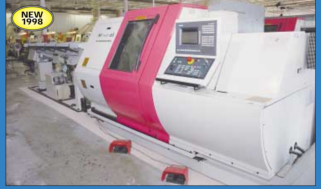
(2) Gildemeister Model MF Twin 65 Opposed Twin Spindle CNC Turning/Milling Centers

TWIN SPINDLE CNC TURNING CENTERS (2) Gildemeister Model MF Twin 65 Opposed Twin Spindle CNC Turning/Milling Centers; S/N's 407410 & 407399, Seimens Sinumerik CNC Control, 7.874 Chuck Cap., Equipped w/ Collet & 3-Jaw Chucks, 9.44" Dia. Of Max Circumference, 7.87" Max Turn Dia., 31.49" Max Spindle Space, 7.48" X-Axis, 21.85" Z-Axis, 23.62" Z-Axis Spindle 2 Travel, 2.55" Spindle 1 & 1.65" Spindle 2 Capacity. 6.69" Spindle 1 & 5.51" Spindle 2 Nose Dia., 3.11" Spindle 1 & 2.20" Spindle 2 Hole Dia., Spindle Speeds to 5,000 RPM Spindle 1 & 6,300 RPM Spindle 2, (2) 12-Position Live Tool Turrets, Live Tool Spindle Speeds to 4,200 RPM, Approx. 15,000 & 13,500 Hours Showing Chip Conveyor, Munson Hwy. (New 1998) SEE PH SEE PHOTO