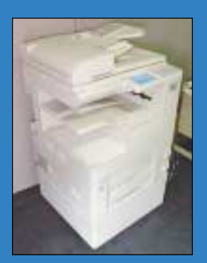
Late Model Office Furniture and Computer Equipment