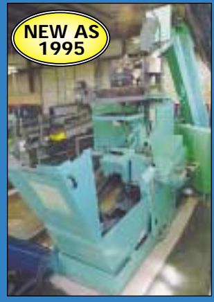
(3) Saspi Model Automatic Flat Die Thread Rollers Up To 1"