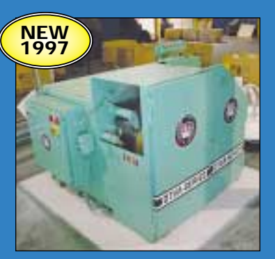
3/8" F.E. Model DTVA-30300-28 In-Line Wire Drawer