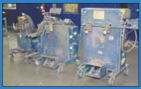
Bank View Butt Welding Machines