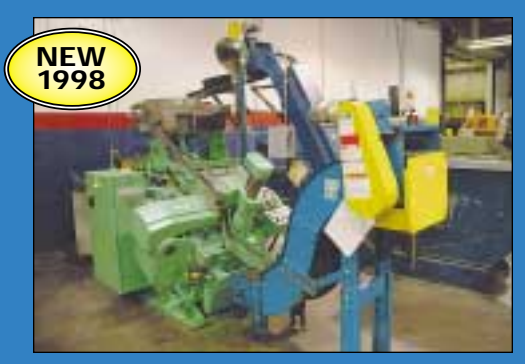
Taihei Model THP-22L High Speed Point Former