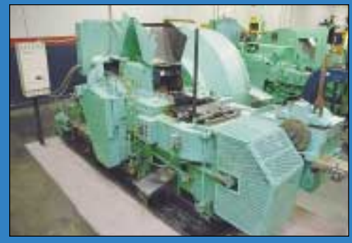
(2) 1/2" National 3-Die Boltmakers