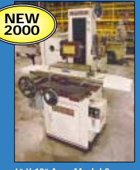
6" X 18" Acer Model Spura-618 Hand Feed Surface Grinder

(3) Dyna Mechtronics Model FM3116 CNC Vertical Milling Machines