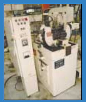
Kinefac Model MC-5-F Kine Thread Roller

Please see Page 6 for More Fastener Related Equipment Including; Photos of the Wire Drawers, Along with Pictures and Info on the Packaging, Sorting, & Assembly Equipment