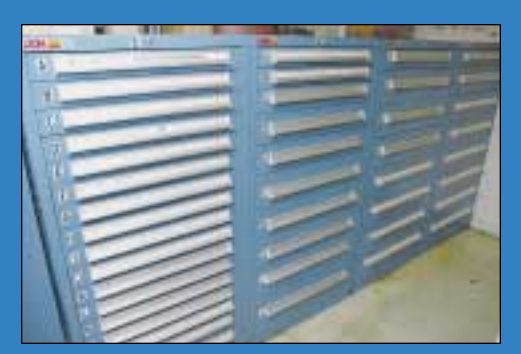
Partial View Lyon Tooling Cabinets