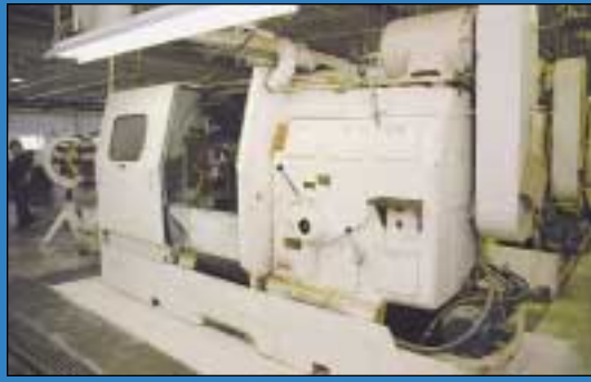
(4) 2-5/8" Acme Gridley Model RB-6 Six-Spindle Automatic Bar Machines