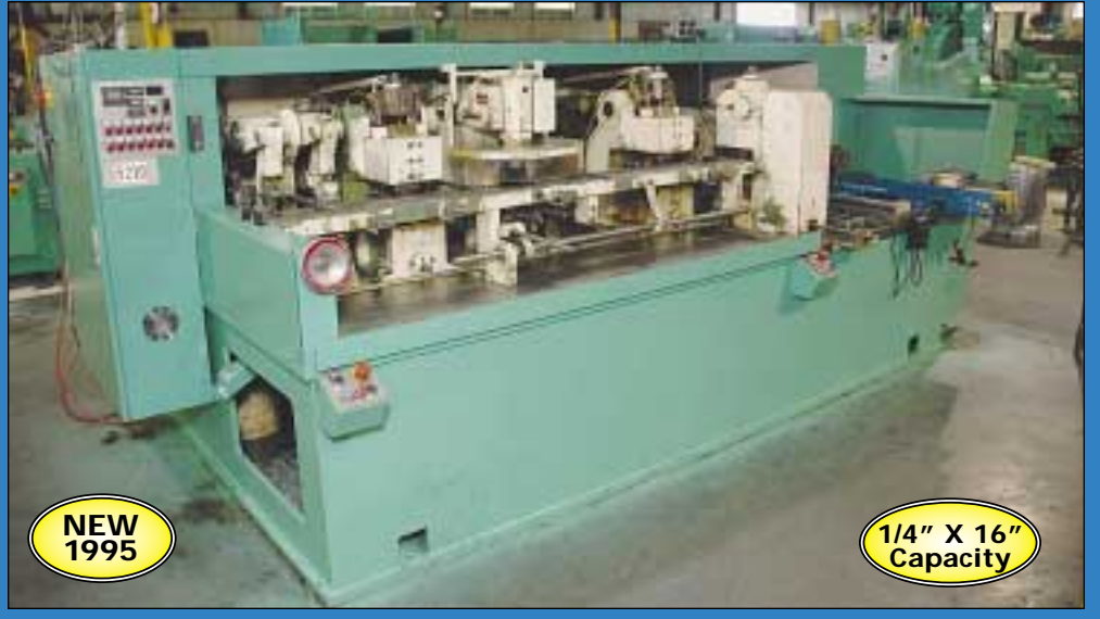
1/4" Amba Aachener Maschinebau Model BM-6 Automatic Extra Long Bolt Heading Machine