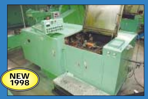
8MM Asahi Sunac Model AT-810 Long Stroke Transfer Header