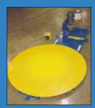
Late Model Shop and Material Handling Equipment