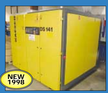
100 HP Kaeser Model D5141 Rotary Screw Cabinet Type Air Compressor