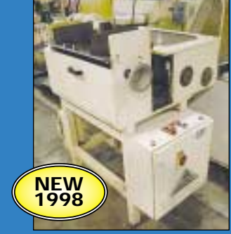
Aacheuer Maschinenbau (AMBA) Model 4155 Straightening Press