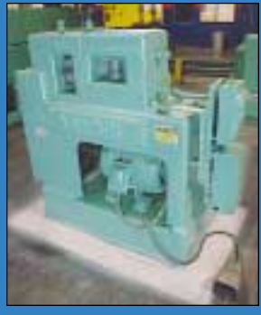
Vaughn Portable Wire Pointer