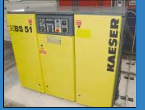
30 HP Sullair Rotary Screw Horizontal Tank Air Compressor

(6) Bin Type Packing Stations w/ Run Out Tables 2,000 LB Electroscale Digital Platform Scale; 100 LB Table Scale, S/N 14571, Munson Hwy