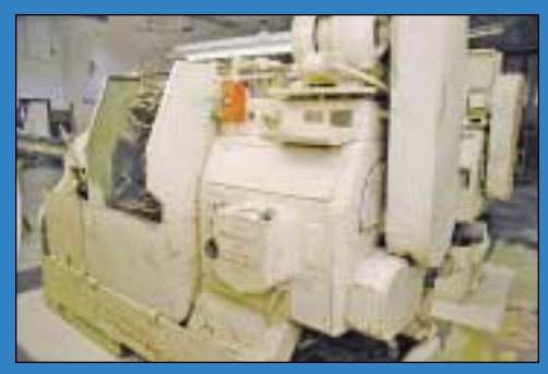
(3) 1-1/4" Acme Gridley Model RA-6 Automatic Bar Machines