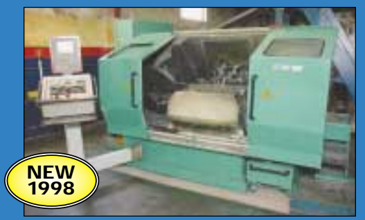
1/2" E.W. Menn Model 60/100H High Performance Profile Thread Roller