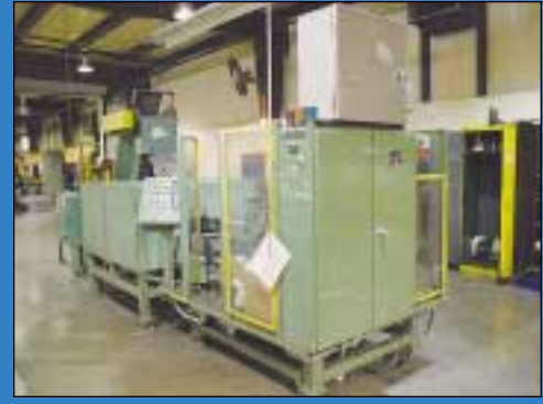
1/2" Capacity Dixon Automatic Dial Type Assembly Machine