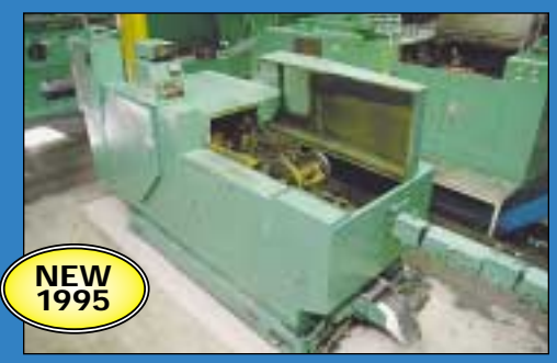
1/4" Nakashimada Model H20-L Ultra Long Stroke Cold Header