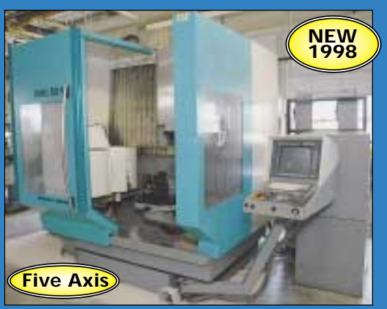
Deckel Maho Model DMU-50V Five-Axis CNC Vertical Traveling Column Universal Milling & Boring Machine

Also Features: Upcoming Sale Information, Printable Color Brochures, Printable Lot Listing Catalogs, Downloadable Forms, Complete Terms of Sale