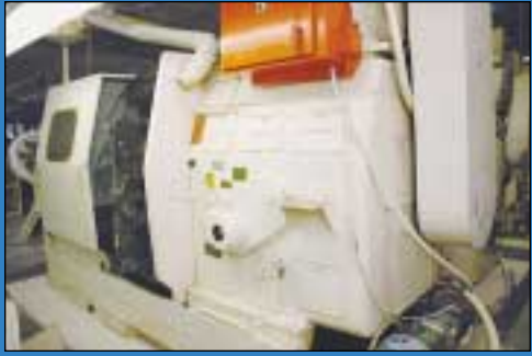
(4) 2-5/8" Acme Gridley Model RB-6 Six-Spindle Automatic Bar Machines