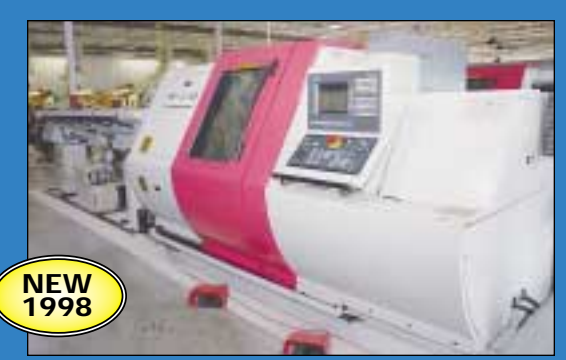
(2) Gildemeister Model MF Twin 65 Opposed Twin Spindle CNC Turning/Milling Centers

12MM Asahi Okuma Model AOT-12XL Extra Long Stroke Transfer Header