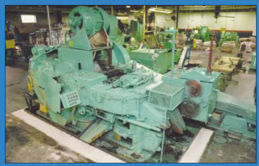
3/4" National 3-Die Boltmaker

1/2" E.W. Menn Model 60/100H High Performance Profile Thread Roller; S/N 98003, 8-12MM Diameter Capacity, Up to 150MM Part Length, 40-480 PPM, 32" Vibratory Bowl Feeder (New 1998) SEE PHOTO