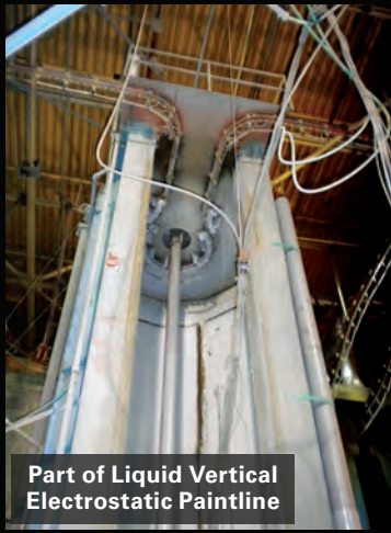
Part of Liquid Vertical Electrostatic Paintline

Items subject to prior sale. Buyers are advised and encouraged to inspect equipment prior to auction