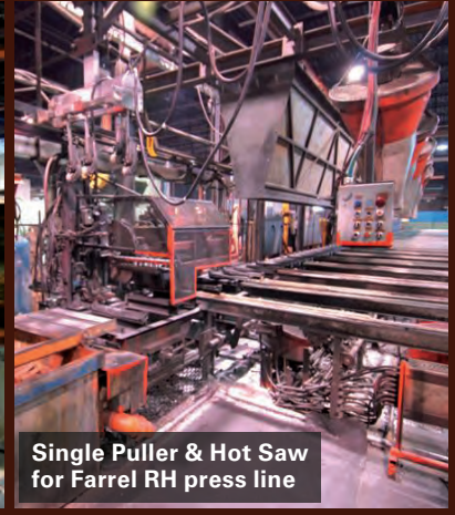
Single Puller & Hot Saw for Farrel RH press line