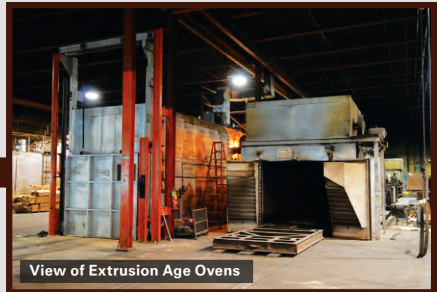
View of Extrusion Age Ovens

TATNALL (1959) Y177 75,000 lbs. cap. tensile tester with cpu; ST IND. 12" optical comparator; SATEC UTM tensile tester, s/n 1482; numerous presses (10-55 ton); (2) 72" vibratory finishers; (2) metal saws; (2007) 2,000lbs. lift trucks with chargers; oven; hoists; hoppers; label printer w/ cpu; scales (table & floor); racks; pallet jacks; bins; 6 stand roll formers; office furniture and MORE