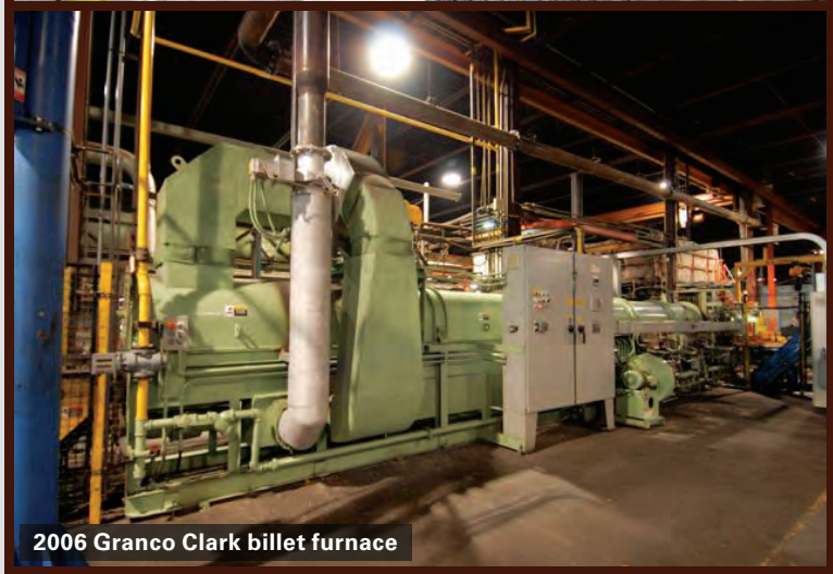
2006 Granco Clark billet furnace