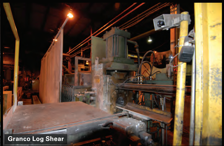
Granco Log Shear