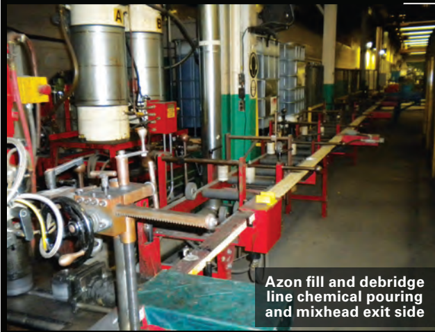
Azon fill and debridge line chemical pouring and mixhead exit side

Fillameter; Bridgemill / Chip Collector, conveyors, motors, controls, etc.