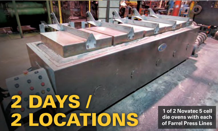
1 of 2 Novatec 5 cell die ovens with each of Farrel Press Lines