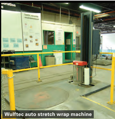
Wulftec auto stretch wrap machine