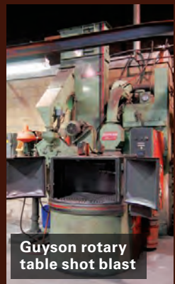
Guyson rotary table shot blast