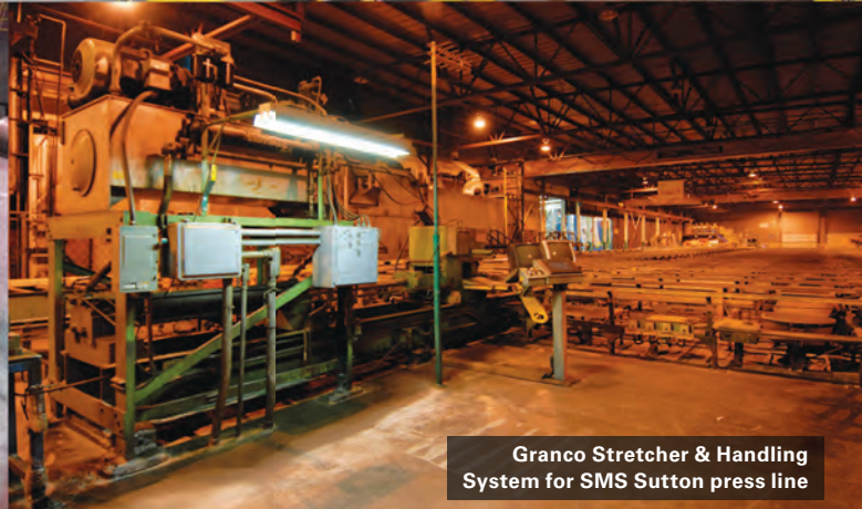
Granco Stretcher & Handling System for SMS Sutton press line