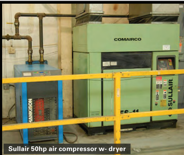
Sullair 50hp air compressor w- dryer