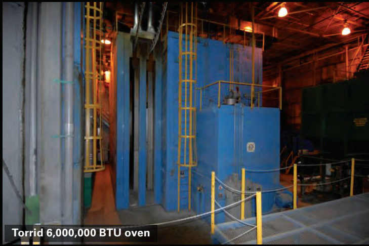
Torrid 6,000,000 BTU oven