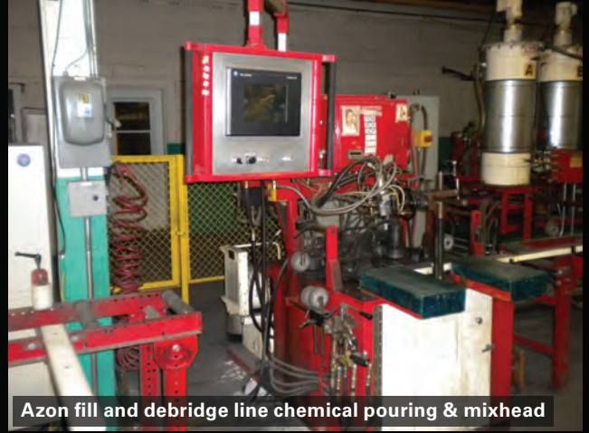
Azon fill and debridge line chemical pouring & mixhead