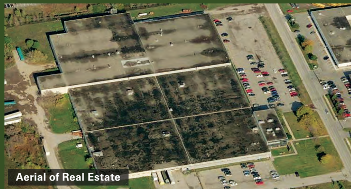
Aerial of Real Estate