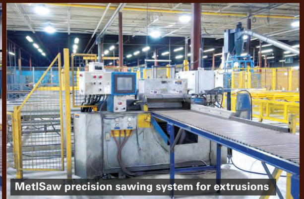
MetlSaw precision sawing system for extrusions