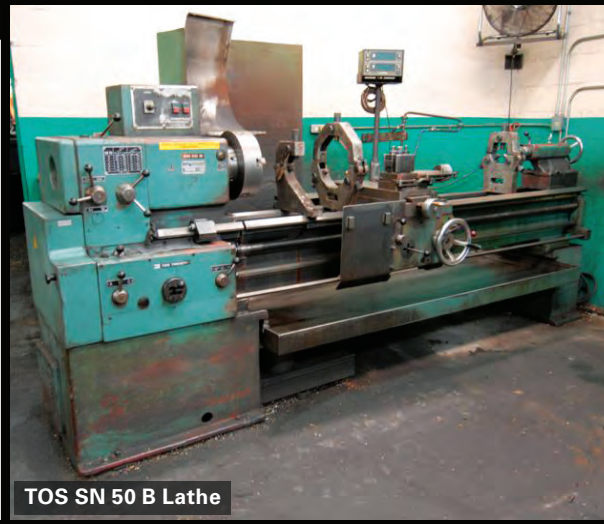
TOS SN 50 B Lathe

Ovens; Grinders; testing; welders; drills; cabinets; racks; carts; strapping; hoppers; ladders; tools; conveyors; dollies; hoists; offices; cafeteria; security system and MORE