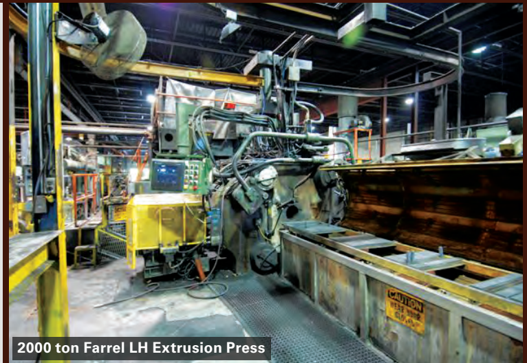
2000 ton Farrel LH Extrusion Press