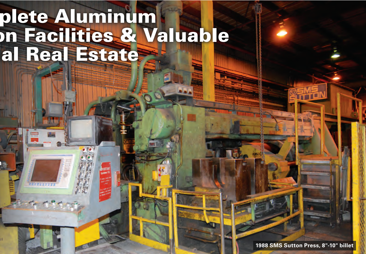
1988 SMS Sutton Press, 8"-10" billet