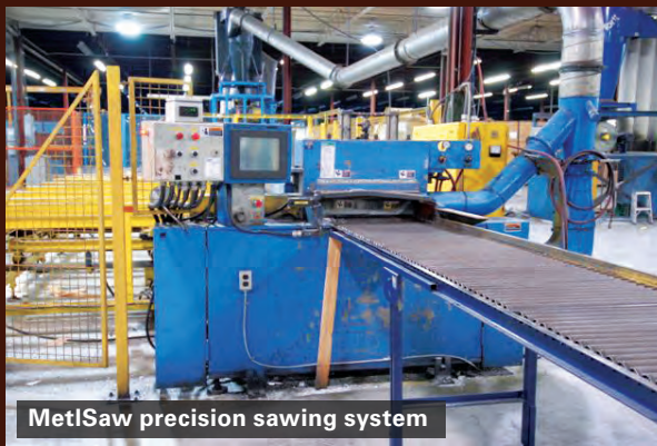
MetlSaw precision sawing system