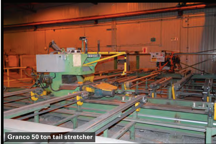
Granco 50 ton tail stretcher