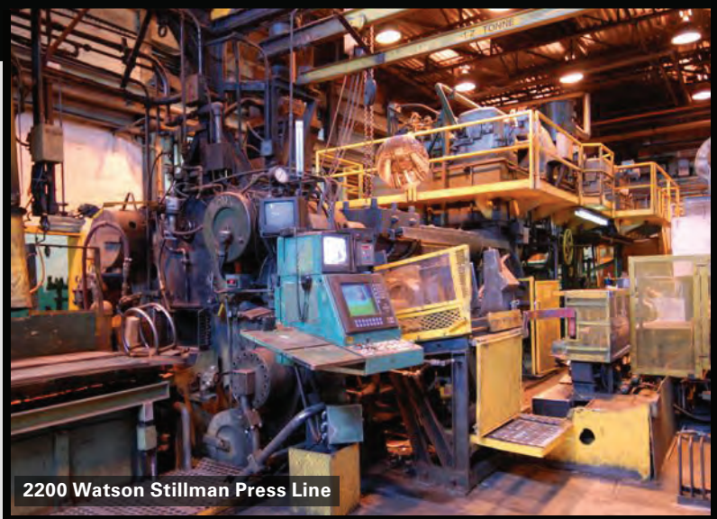
2200 Watson Stillman Press Line