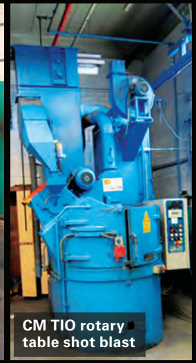
CM TIO rotary table shot blast