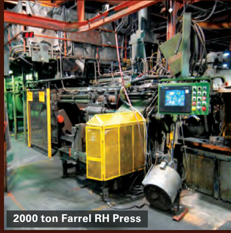
2000 ton Farrel RH Press