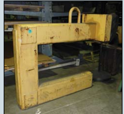
Caldwell 20,000# Coil Lift