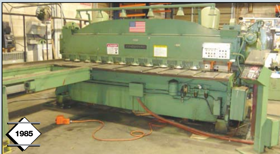
¼" x 12' Cincinnati Mdl. 2CC12 "Auto Shear" Power Squaring Shear