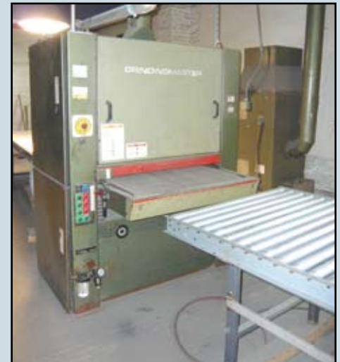
36" Grinding Master Mdl. MSBB900 Belt Sander

With BIDSPOTTER.COM you can bid on items in auctions from anywhere in the world! To register to bid in this Koster Industries Inc. auction, please visit us at www.bidspotter.com