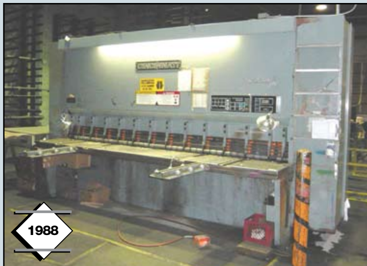
¾" x 12' Cincinnati Mdl. 750X12 Hydraulic Power Squaring Shear