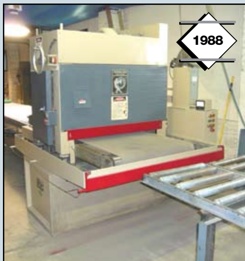
36" Timesaver Mdl. 137-1HDW Belt Sander