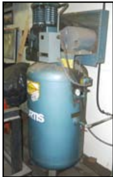
5HP Curtis Mdl. E2VT8-A2 Air Compressor

Presorted First-Class Mail U.S. Postage PAID Minneapolis, MN Permit #3723