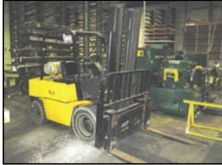
View of Forklift Trucks