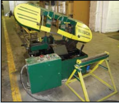
10" x 18" Rusch Mdl. HBSA-250 Horizontal Bandsaw