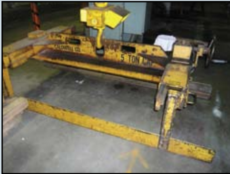
Caldwell 5 Ton Sheet Lifter, with Digital Scale