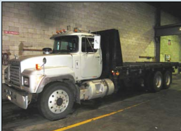
1997 Mack Mdl. 300L 21' Stake Body Diesel Truck

Inspection Dates: Tuesday, July 14th from 8am to 4pm & morning of sale