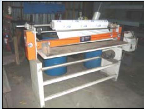
62" Walco Mdl. 82-C-1M-62 Laminator