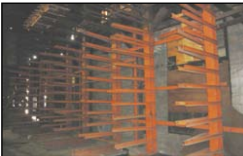
View of Assorted Heavy Duty Cantilever Racking & Adjustable Racking

Inspection Dates: Tuesday, July 14th from 8am to 4pm & morning of sale