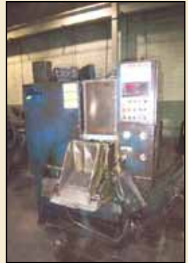
Kasto Mdl. SSB260VA Automatic Vertical Bandsaw