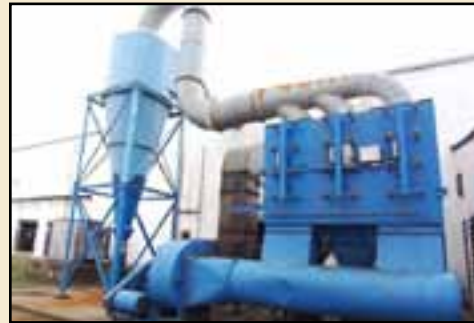
View of Torit Dust Collector