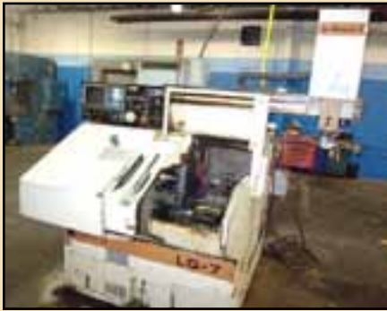
Wasino LG-7 CNC Gang Type Lathe