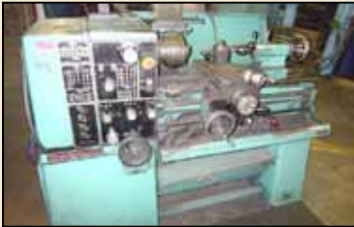
Harrison "AA" Lathe with Trak DRO