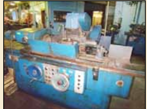
10' x 30' Cincinnati Mdl. R-75 Universal Cylindrical Grinder