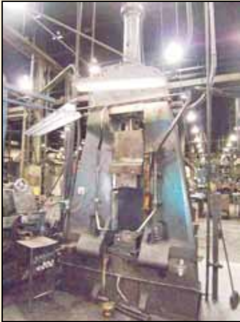
1500 Lbs. Chambersburg/Ceco Drop Hammer

Can't Attend the Auction? Bid Online at www.bidspotter.com