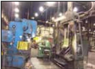
View of 2000 Lbs. Chambersburg/Ceco Cell

Presorted First-Class Mail U.S. Postage PAID Minneapolis, MN Permit #3723