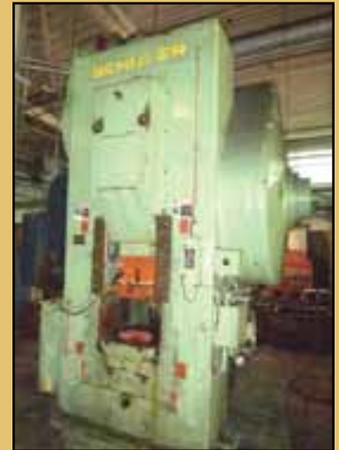
400 Ton Schuler Type PKNR400/0.52 Knuckle Joint Press