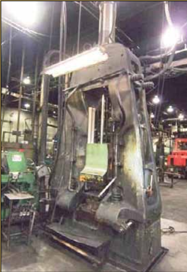
2000 Lbs. Chambersburg/Ceco Drop Hammer

Inspection Date: Monday, May 17, 2010 from 8 a.m. to 4 p.m. & morning of sale