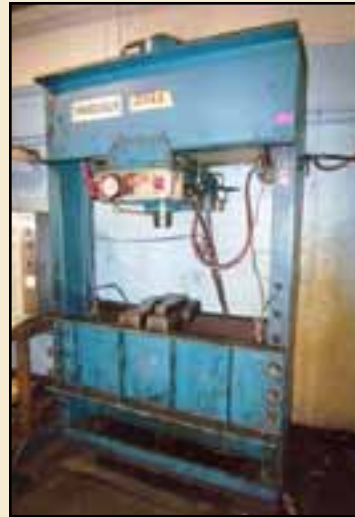
150 Ton Dake Mdl 6-650 H-Frame Hydraulic Press