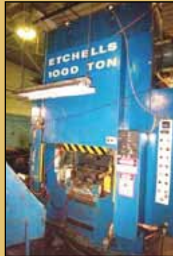
1000 Ton Etchell Mdl. 1000CP Coining Press