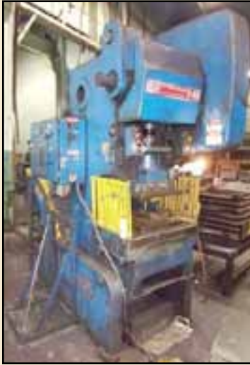
60 Ton Bliss C-60 OBI Flywheel Type Punch Press