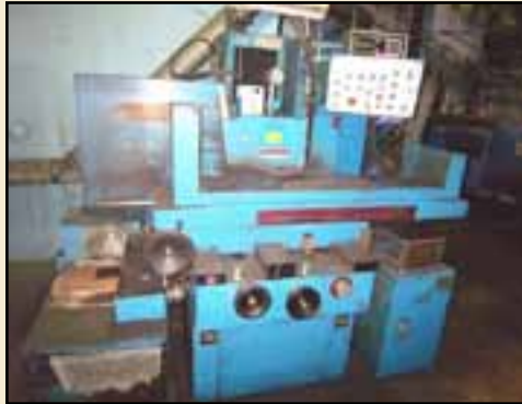
10' x 24' Boyar Schultz Mdl. 2550 Automatic Feed Surface Grinder