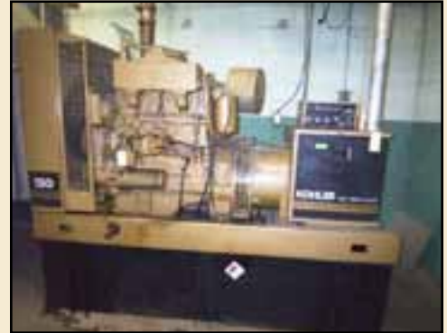
150 HP Kohler "Fast Response II" Diesel Generator