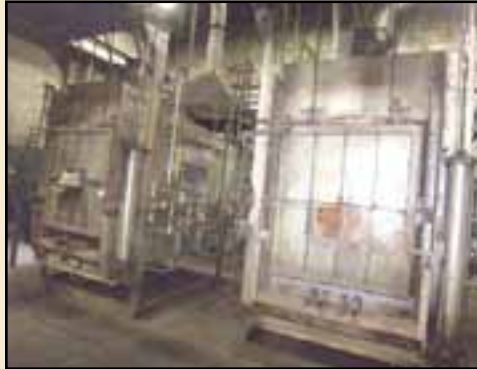
View of Surface Combustion Furnaces