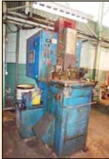
Ohio Broach Mdl. VSH5D-24P Vertical Broach