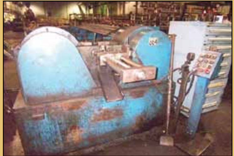
Fenn #125 Impact Cut-Off Shear with Barfeed